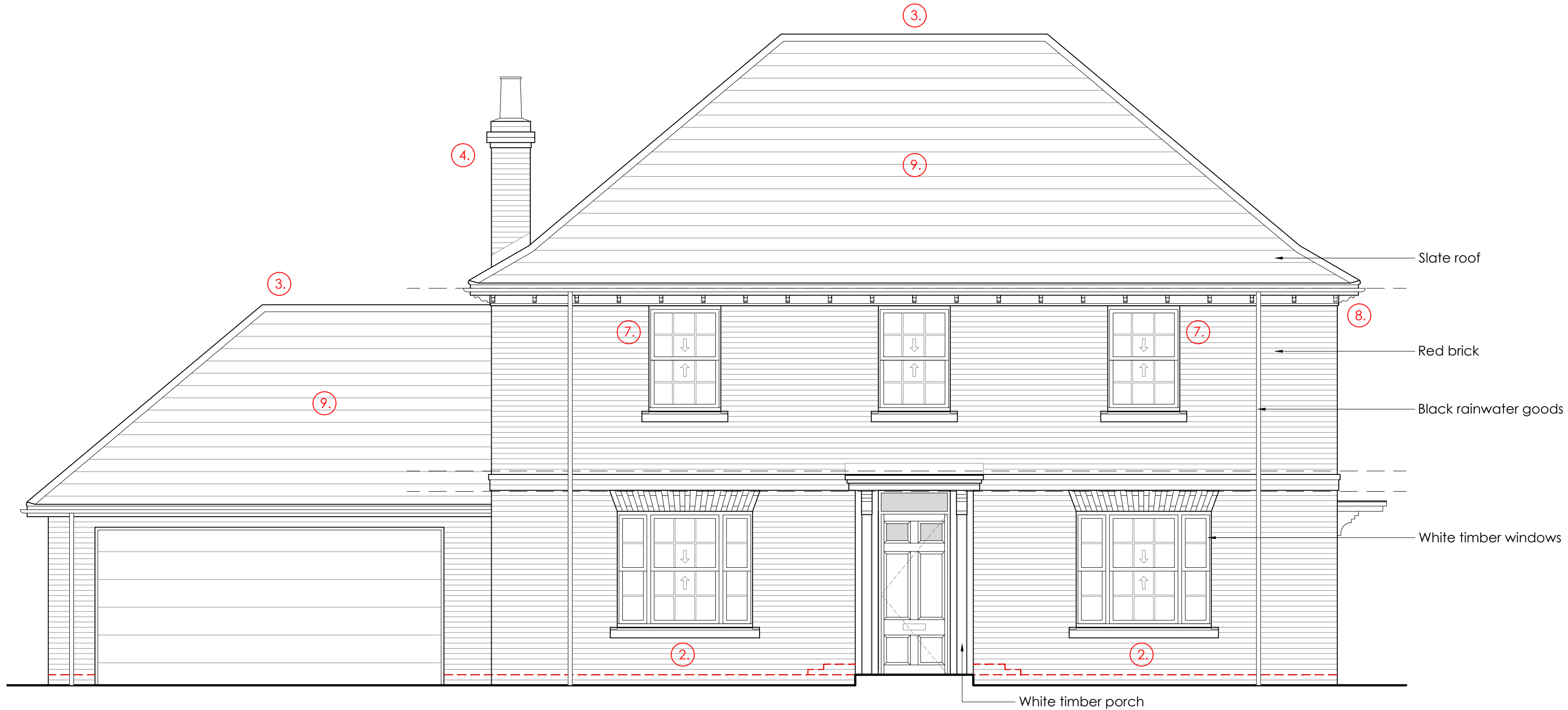
NORTH WEST ELEVATION Scale 1:50 @ A1 or 1:100 @ A3