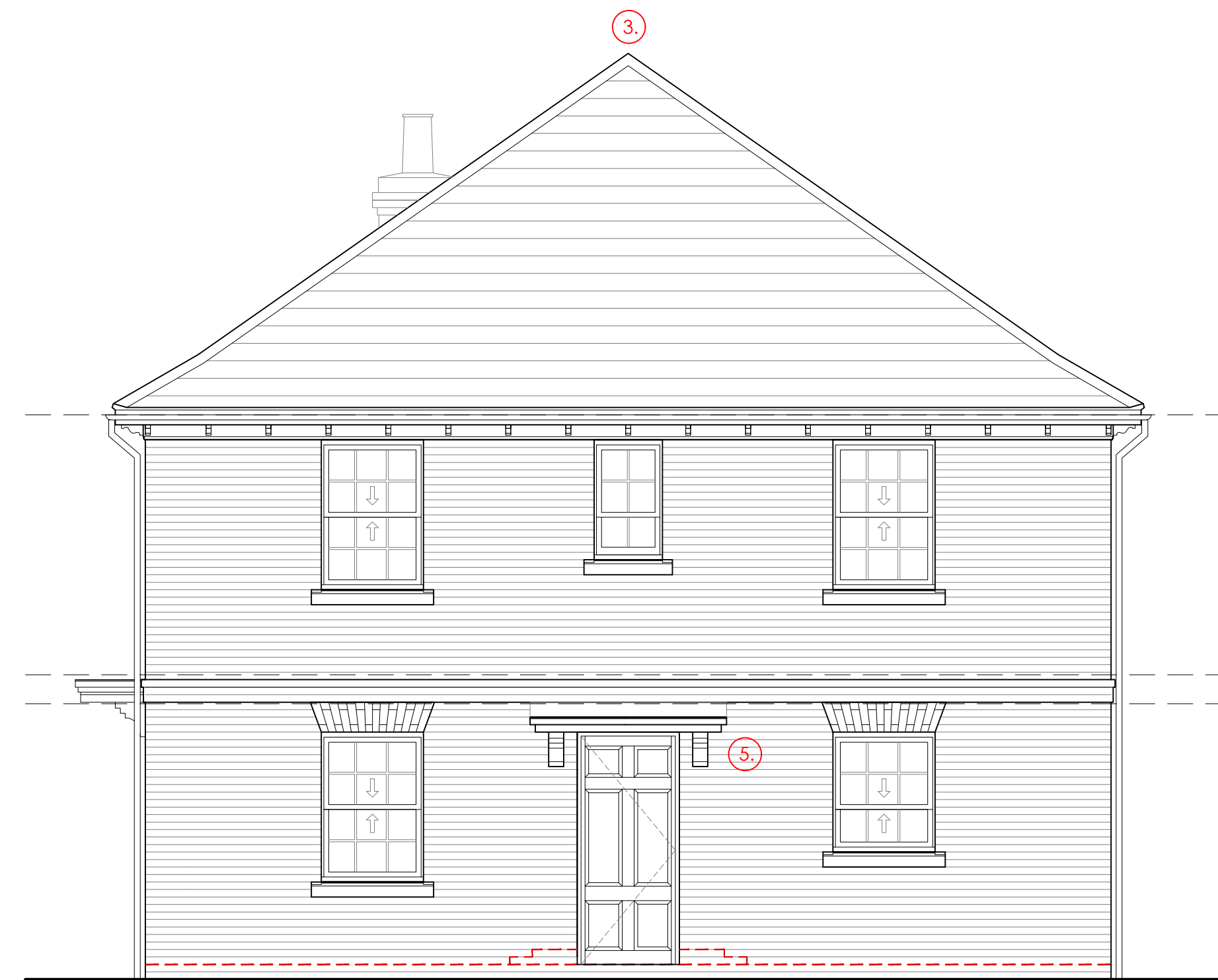
SOUTH WEST ELEVATION Scale 1:50 @ A1 or 1:100 @ A3