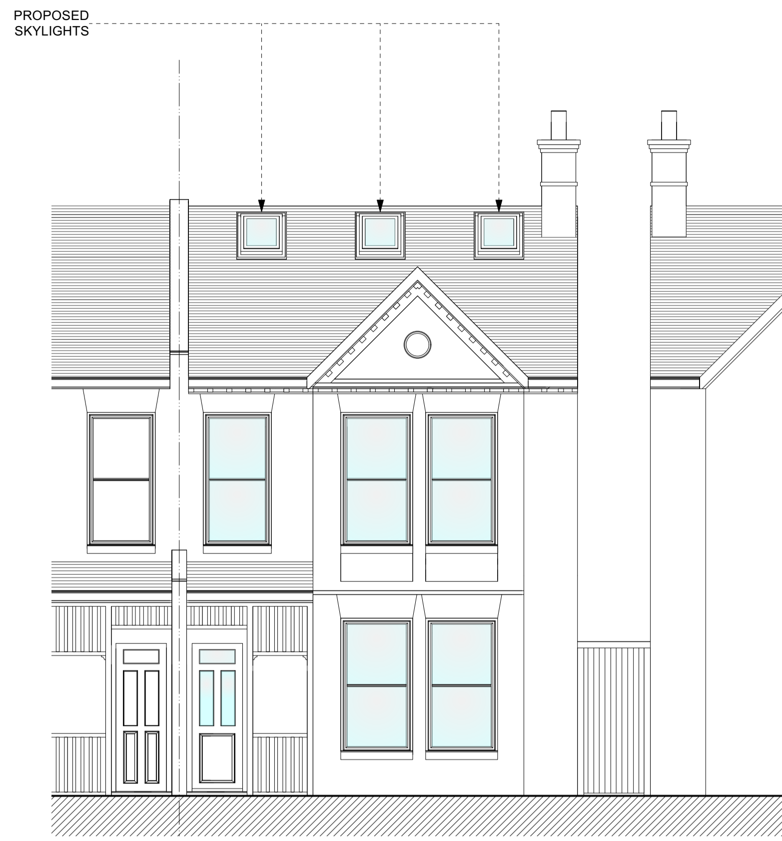
1 Proposed Front Elevation Scale: 1:50

1. Contractors must check all dimensions on site. Only figured dimensions are to be worked from. Discrepancies must be reported to the Architect or Engineer before proceeding. © This drawing is copyright