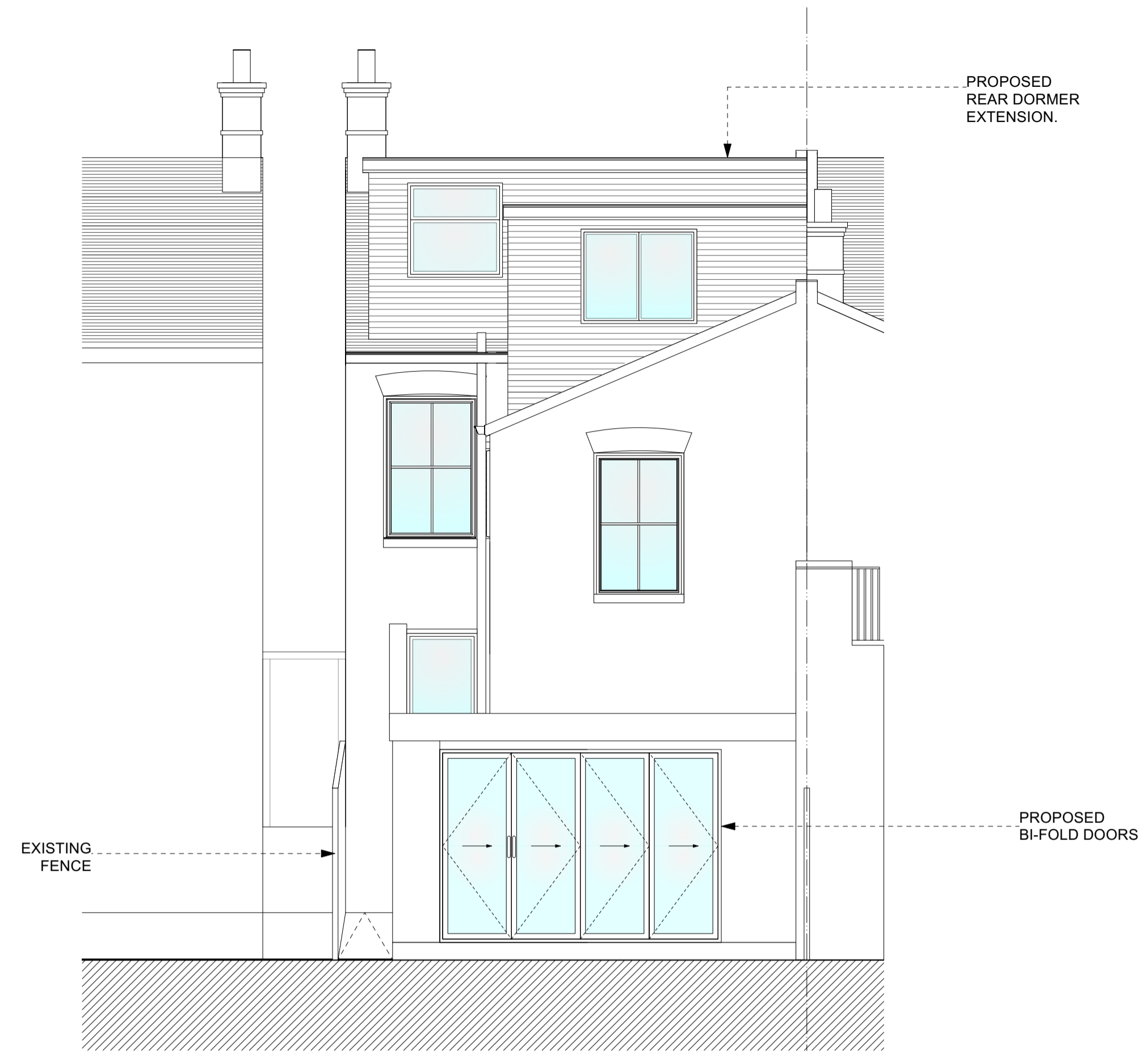
2 Proposed Rear Elevation Scale: 1:50