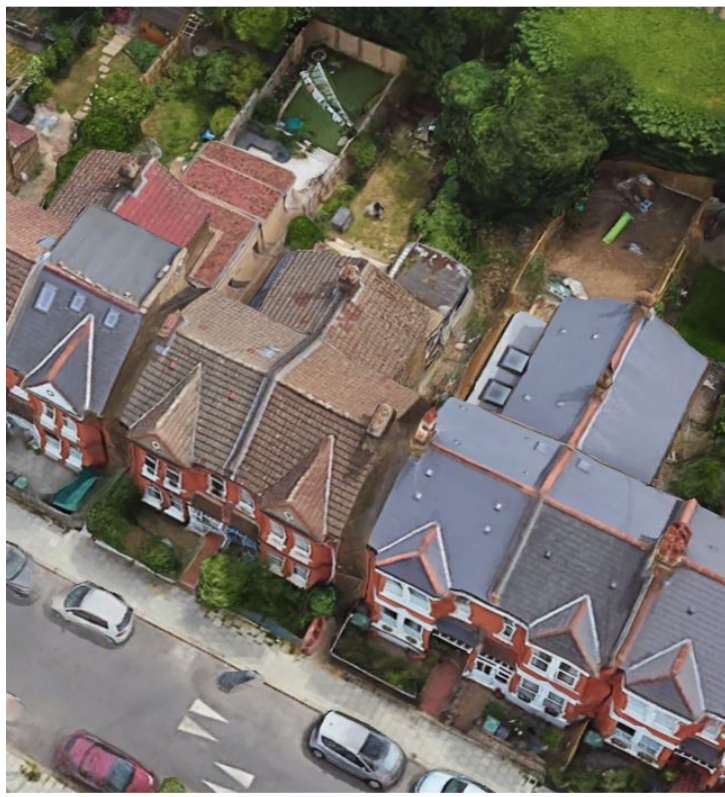
CURRENT CONDITION: AERIAL VIEW