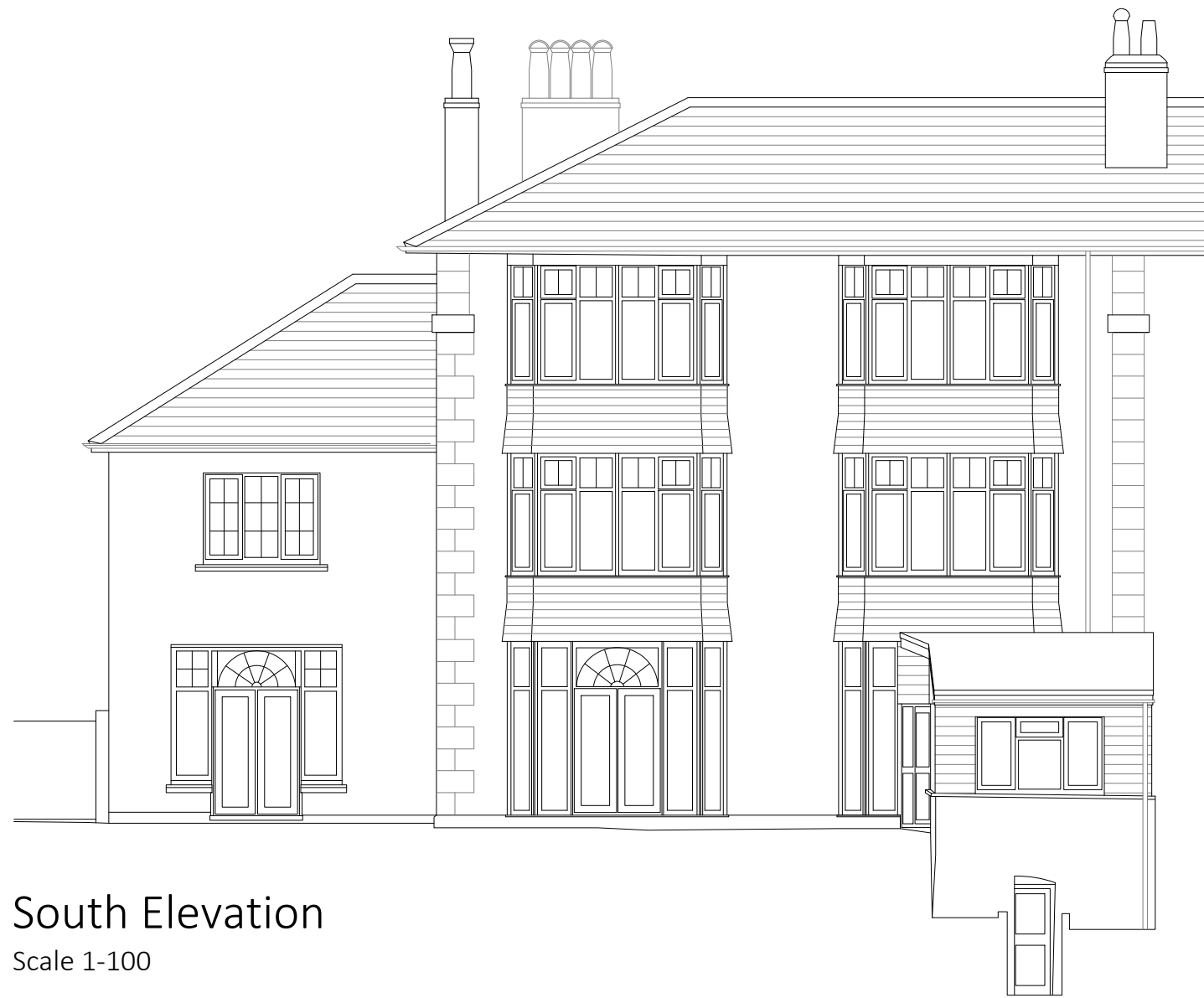
South Elevation Scale 1-100