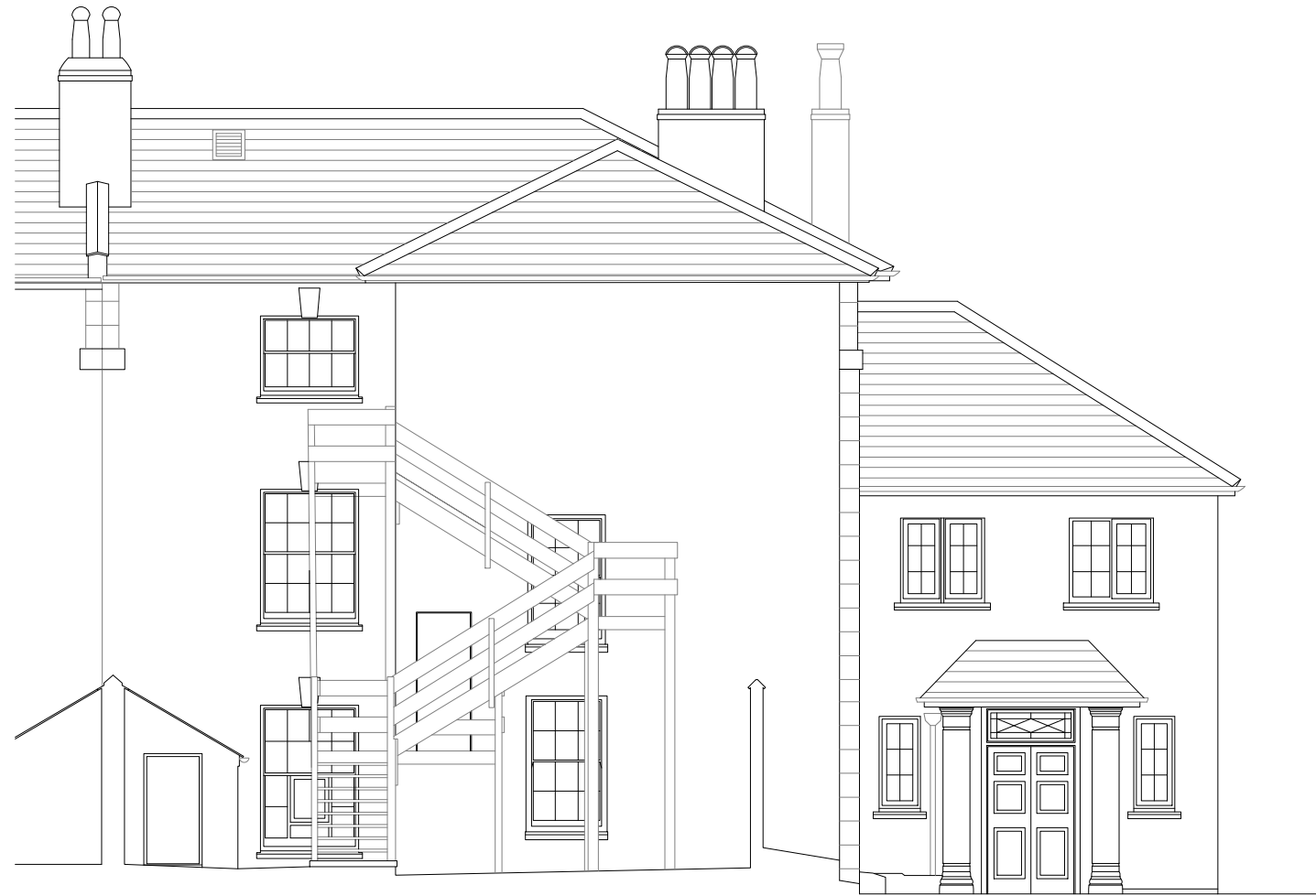
North Elevation Scale 1-100