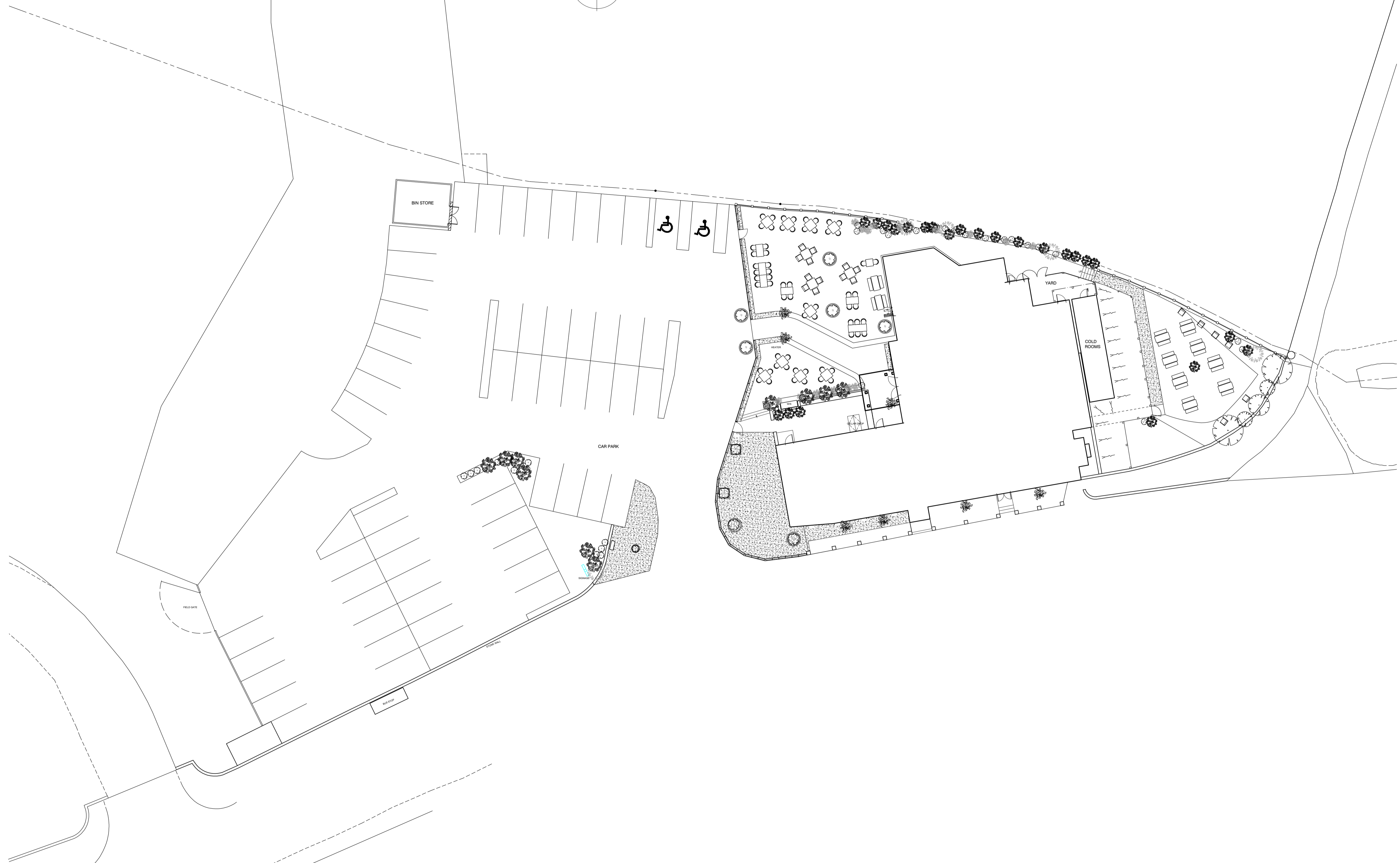
EXISTING EXTERNAL PLAN Scale: 1:200 @ A1