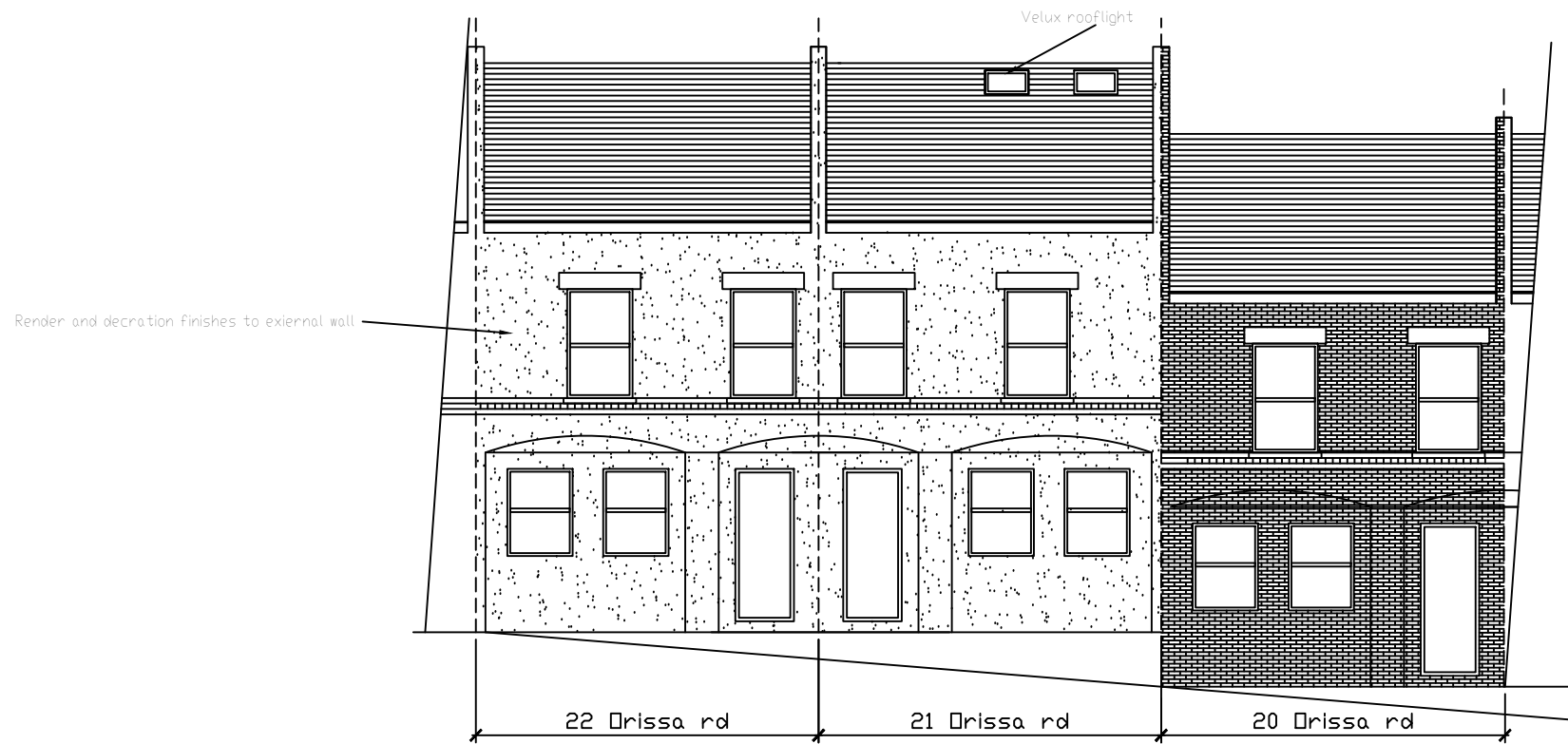
Existing Street View (Front Elevation)