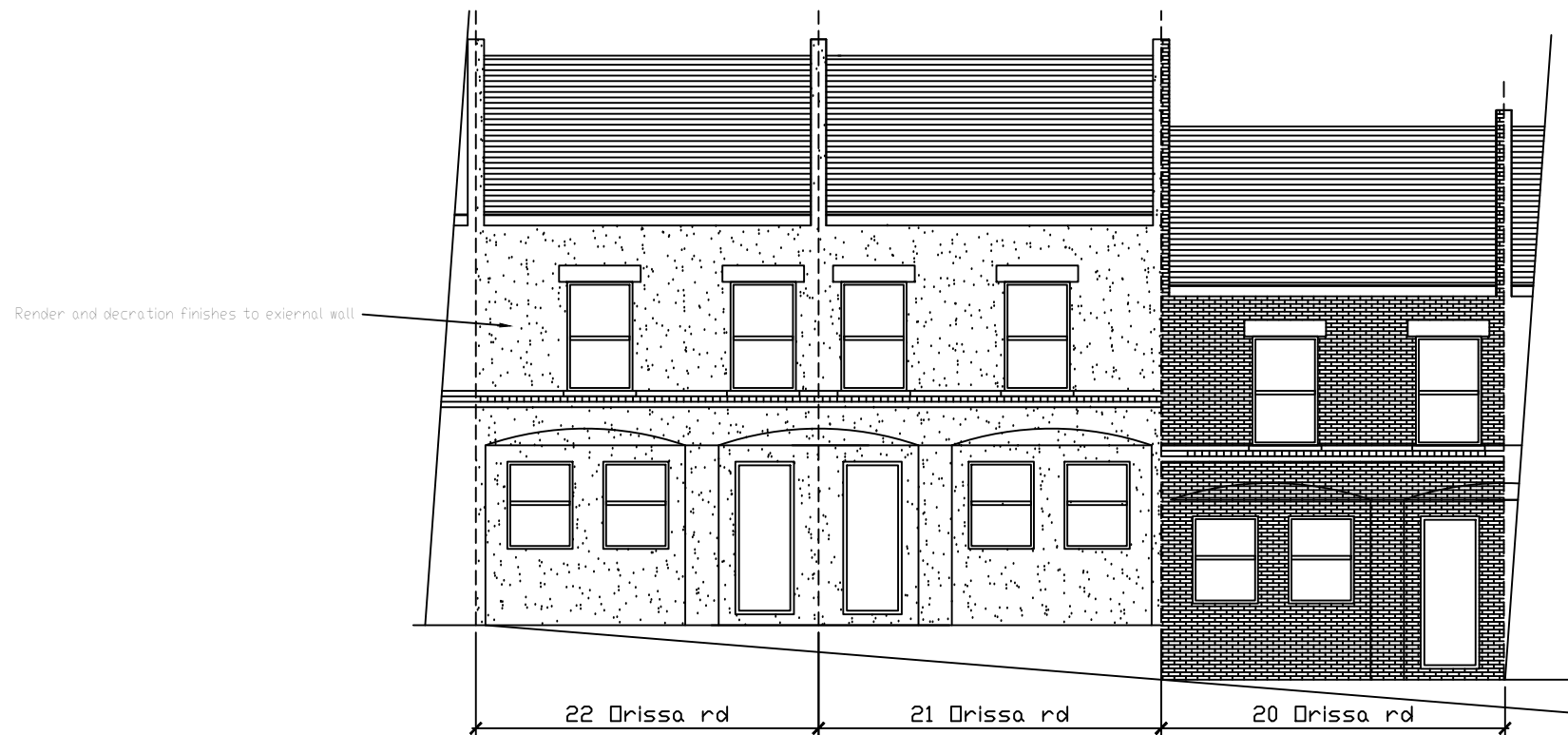
Existing Street View (Front Elevation)