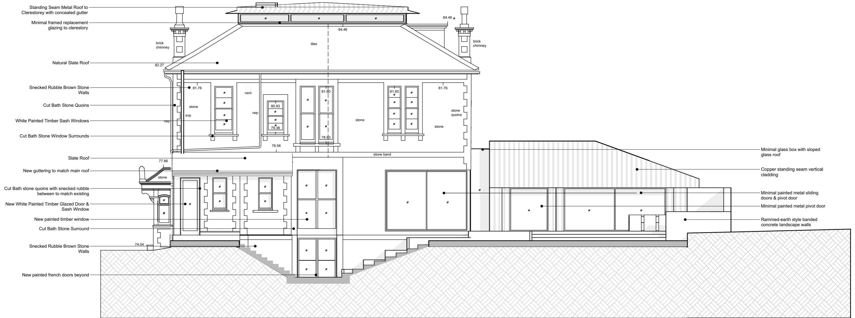
1 Rear Elevation 1:100