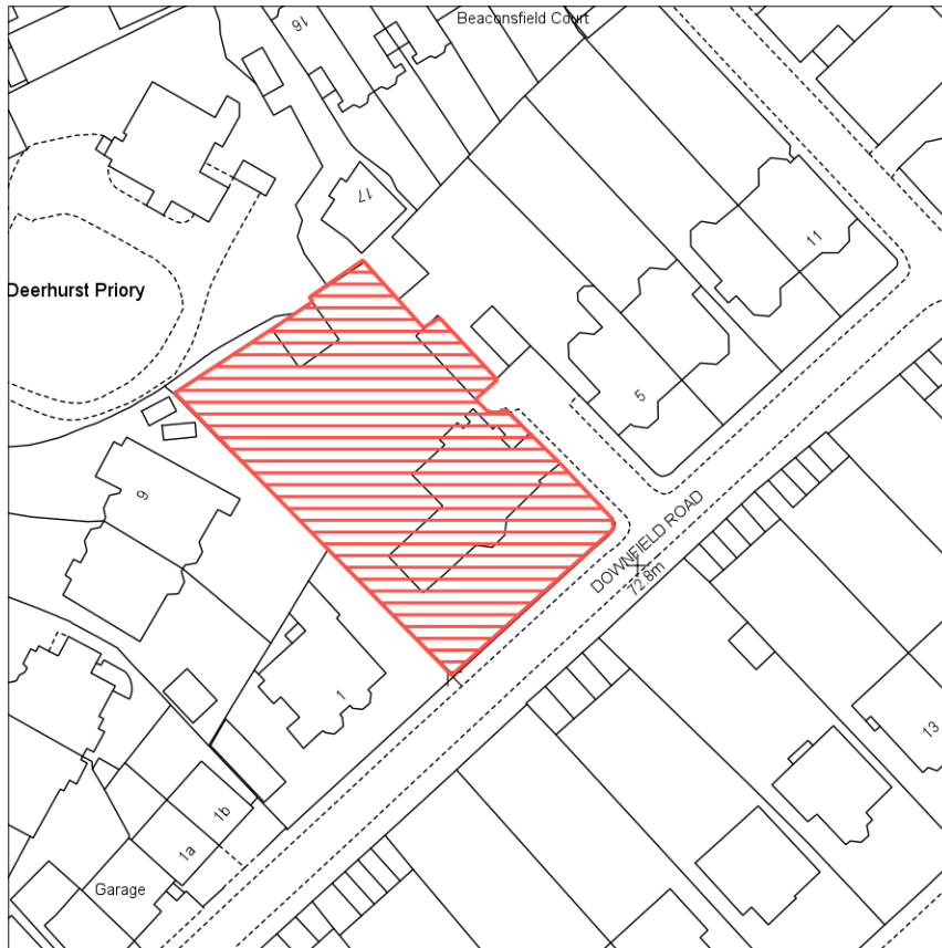
3, Downfield Road, Clifton, Bristol BS8 2TG