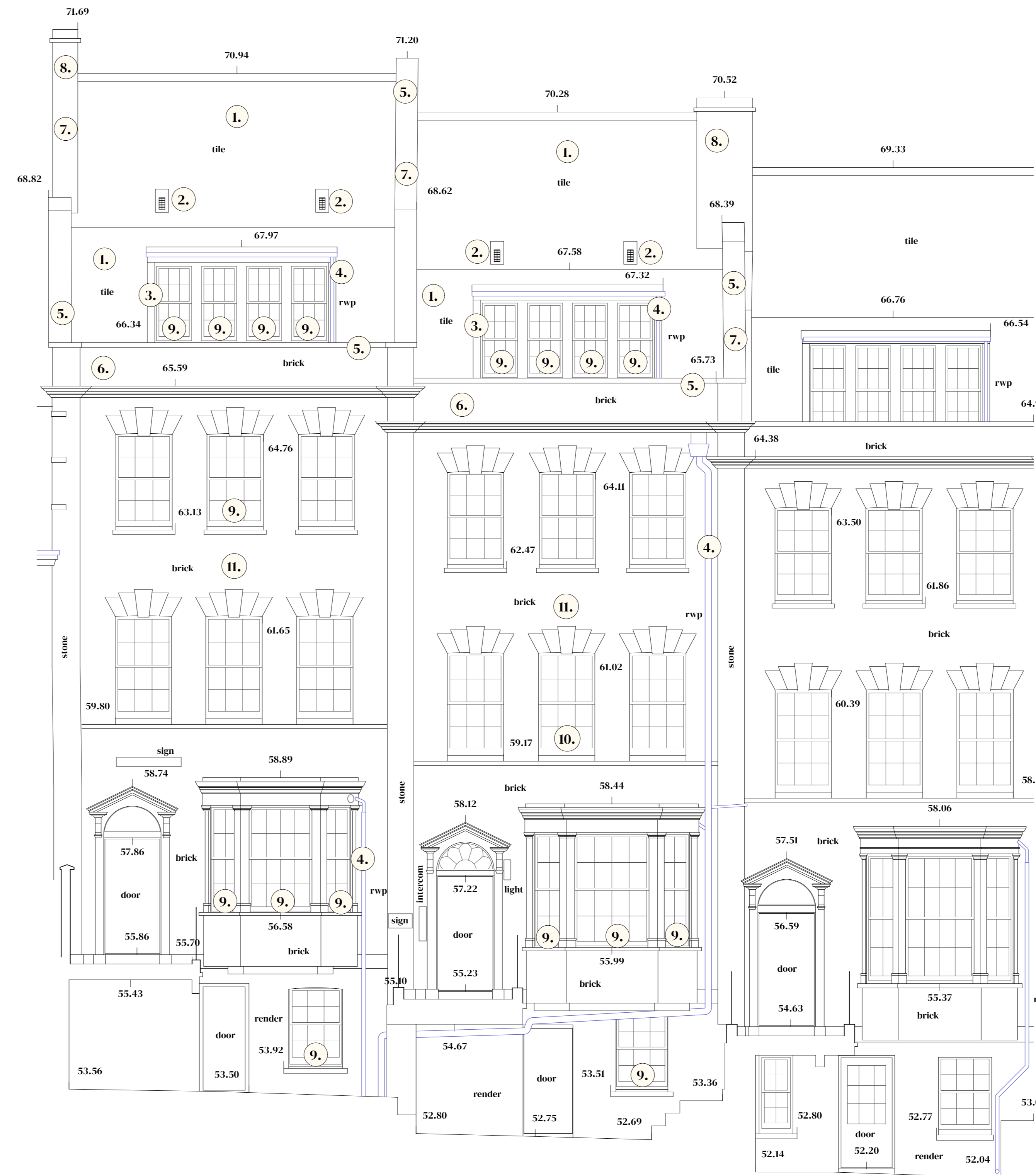
No. 10 Upper Berkeley Place