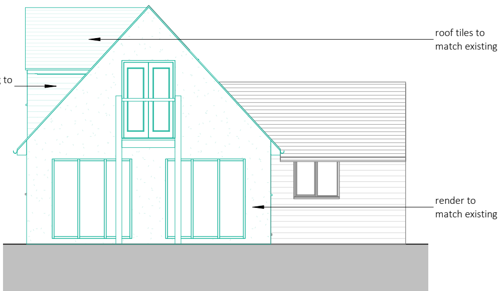
Proposed Rear Elevation 1 : 100