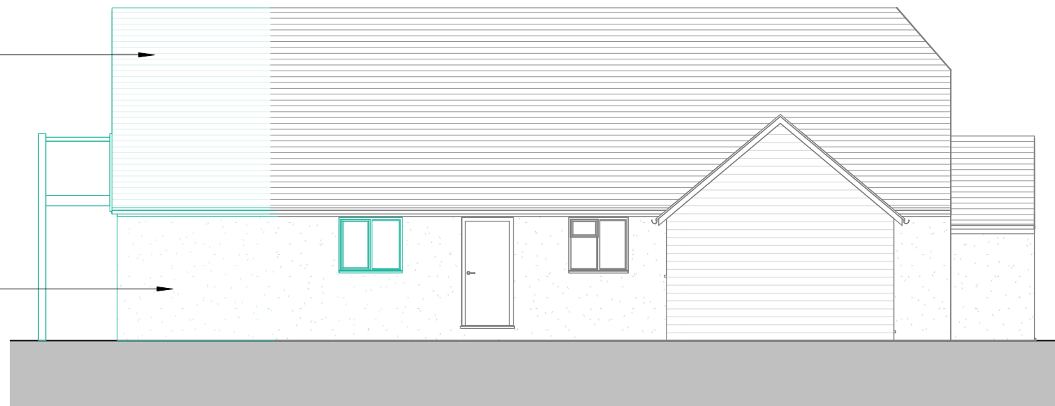
Proposed Side Elevation 1 1 : 100

PROJECT; Paddock View 15c, Little Horwood, Great Horwood, MK17 0QE