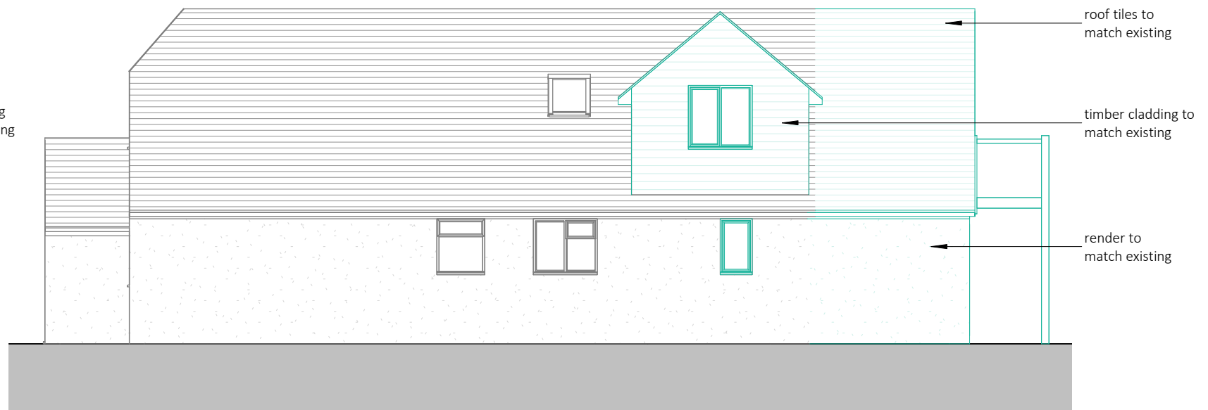
Proposed Side Elevation 1 : 100