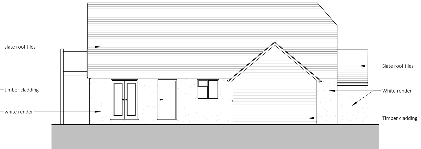
Existing Side Elevation 1 1 : 100

PROJECT; Paddock View 15c, Little Horwood, Great Horwood, MK17 0QE