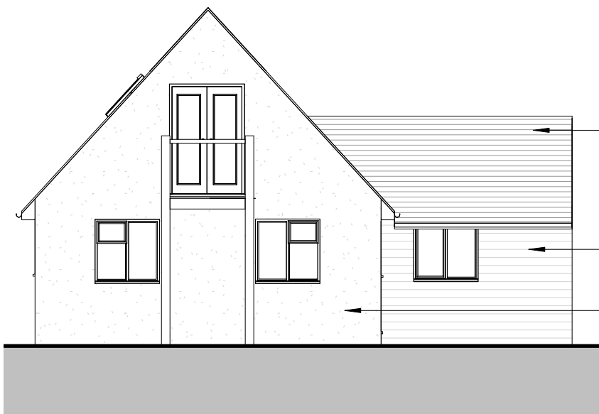
Existing Rear Elevation 1 : 100