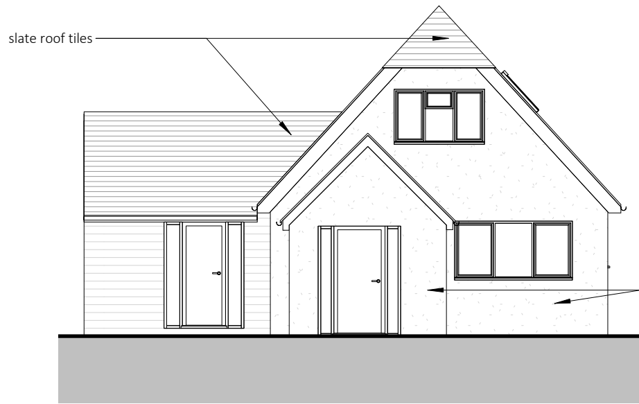
Existing Front Elevation 1 : 100