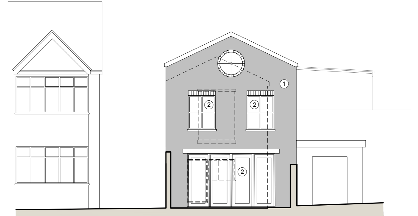
FRONT ELEVATION (towards Hutton Grove)