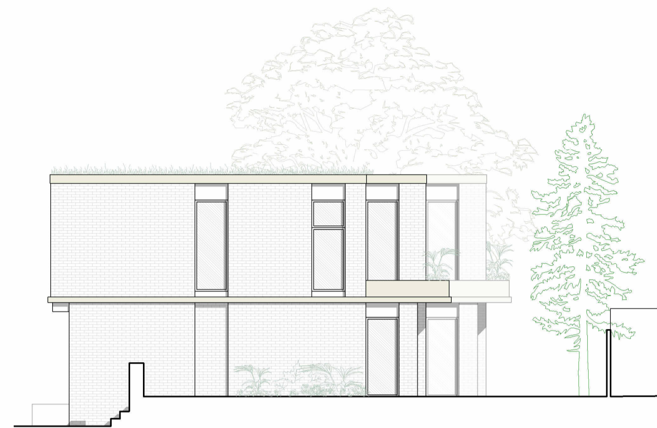
House B - Side Elevation 1 : 100