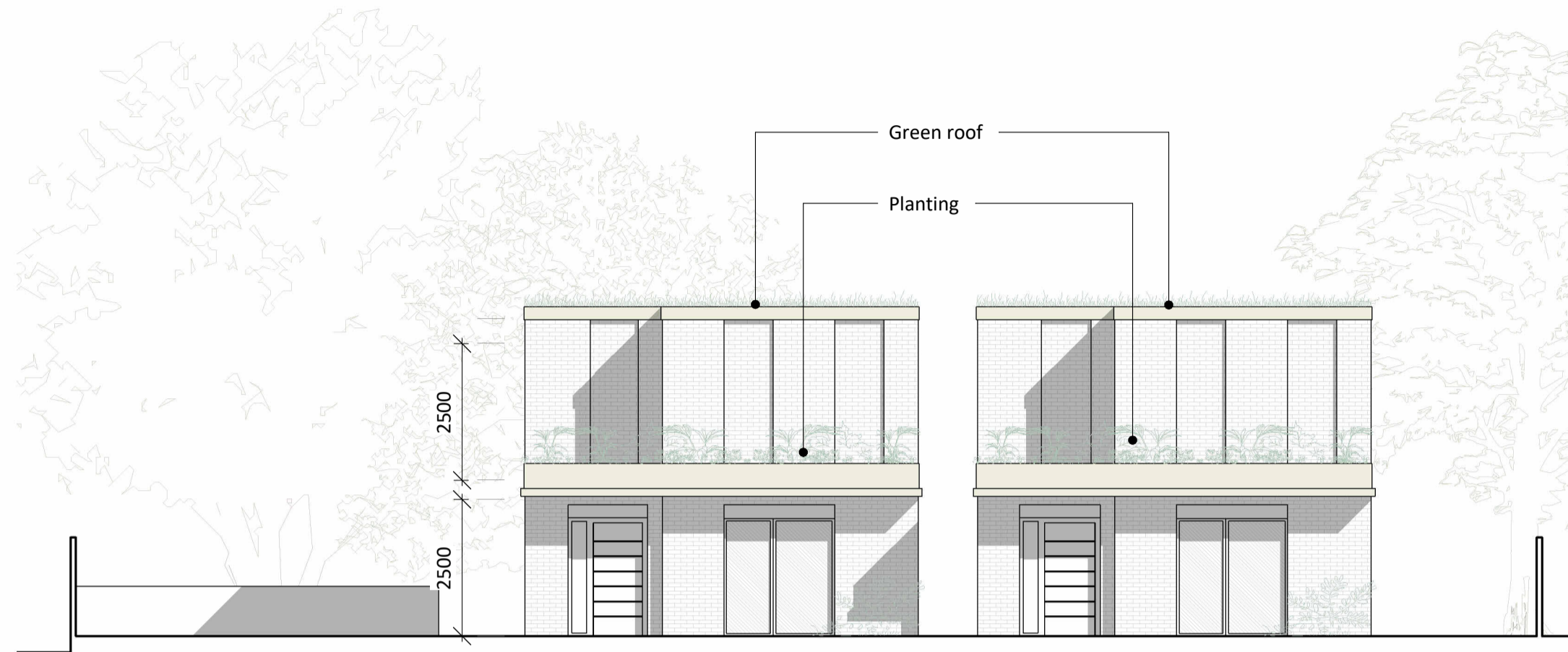
House B & C- Front Elevation 1 : 100