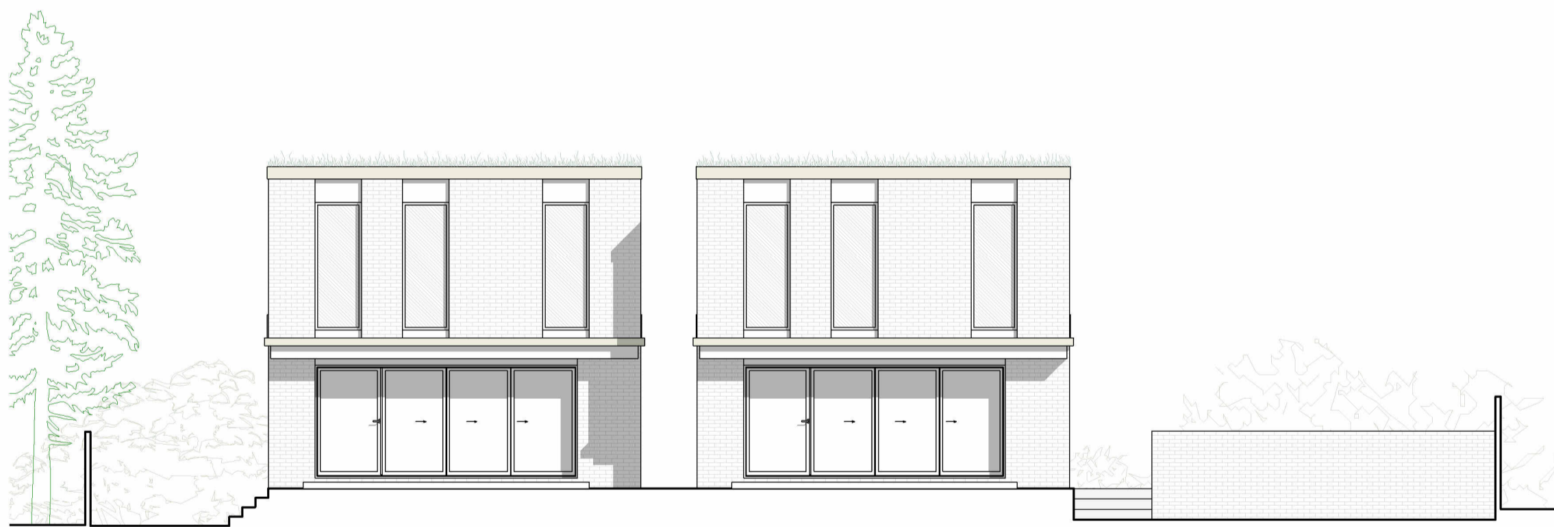
House B & C- Rear Elevation 1 : 100