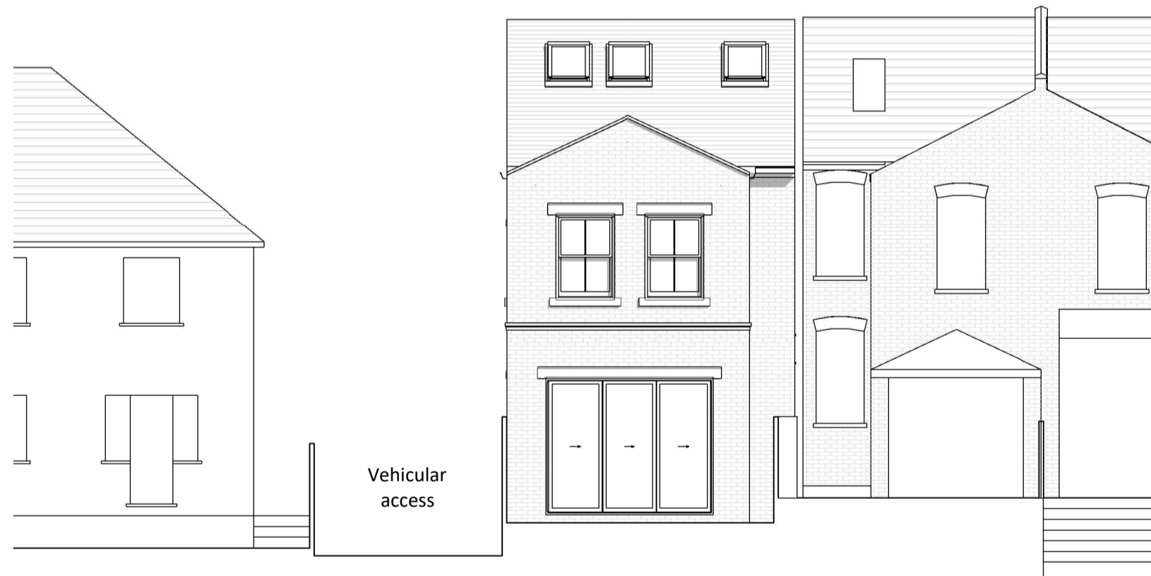
House A - Rear Elevation 1 : 100