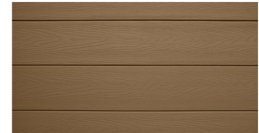
Dura Cladding Resist WeatherBoard composite cladding boards in Red Cedar or similar.