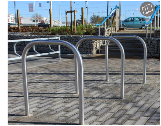
Sheffield Bike Stands