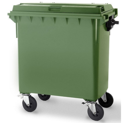
1100l Wheelie Bins

Reference: https://wheeliebinwarehouse.com/1100-litre-wheelie-bin/