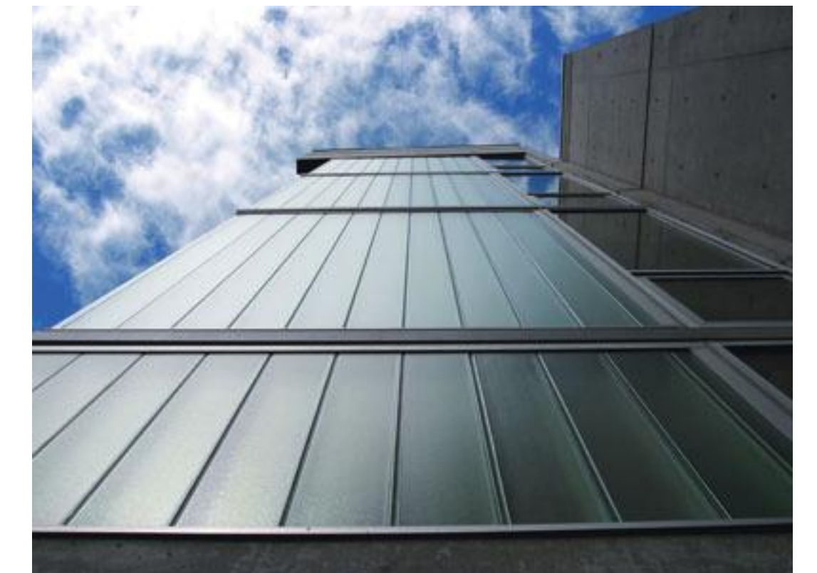
7 Pilkington Profilit™