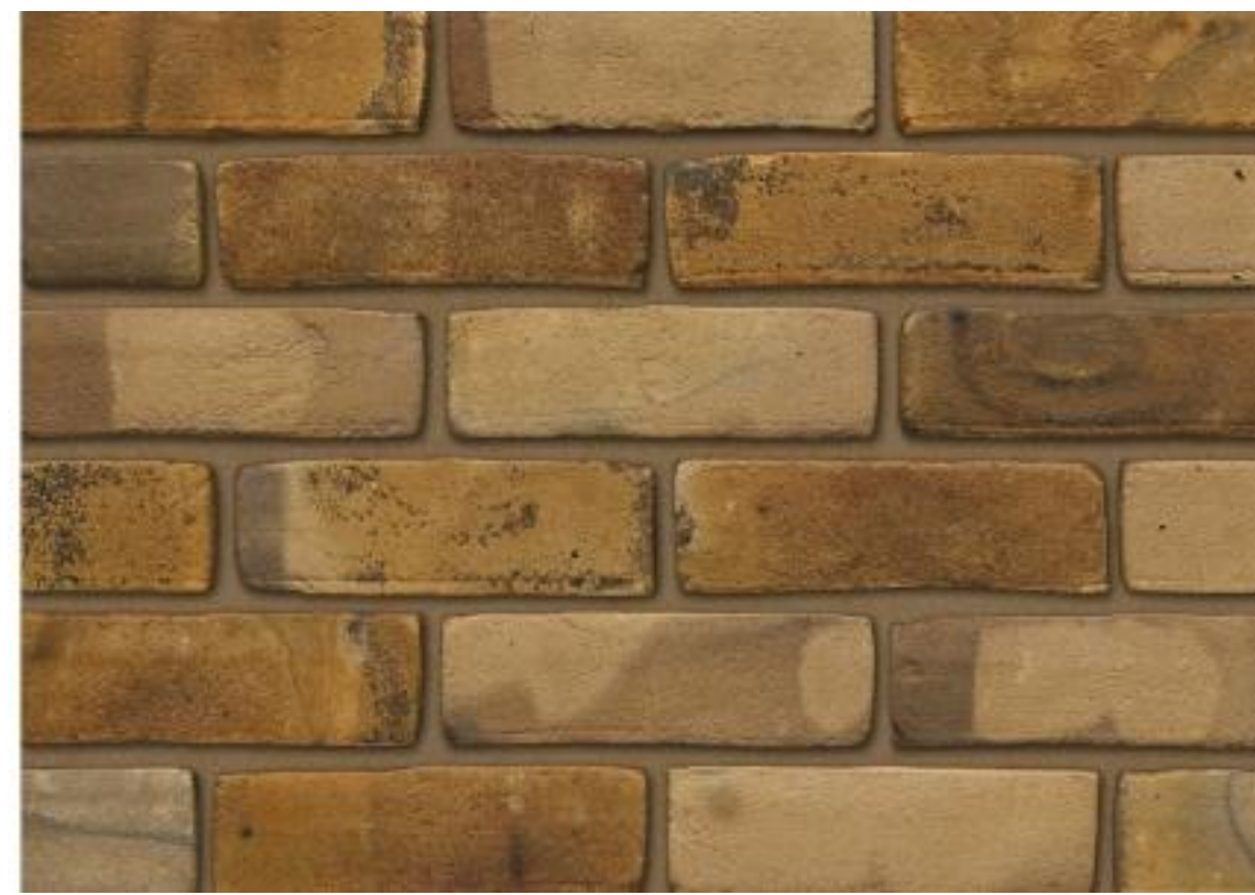
3 Ibstock Brick Funton Old Chelsea Yellow