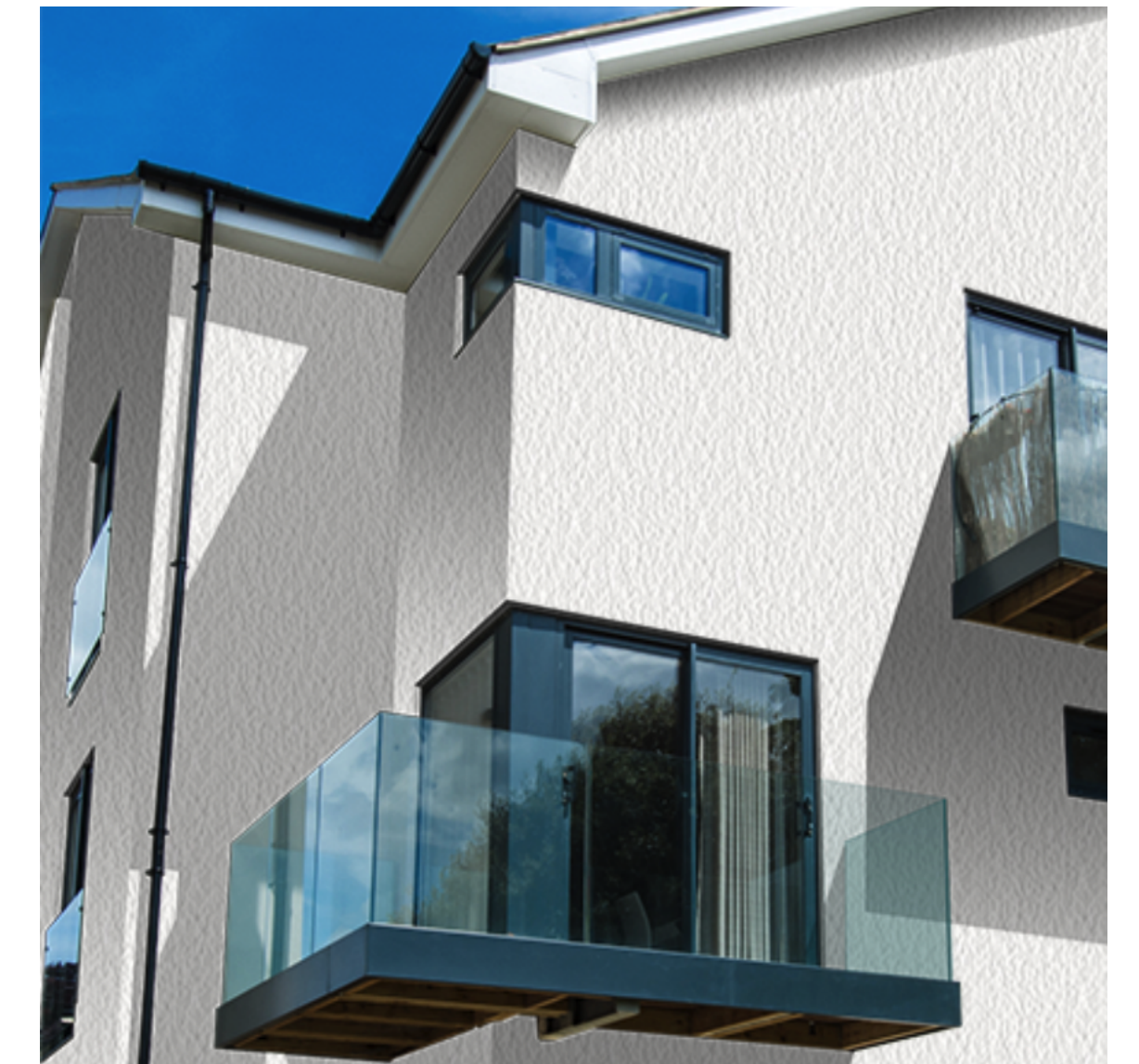
6 Off-White Through Colour Render