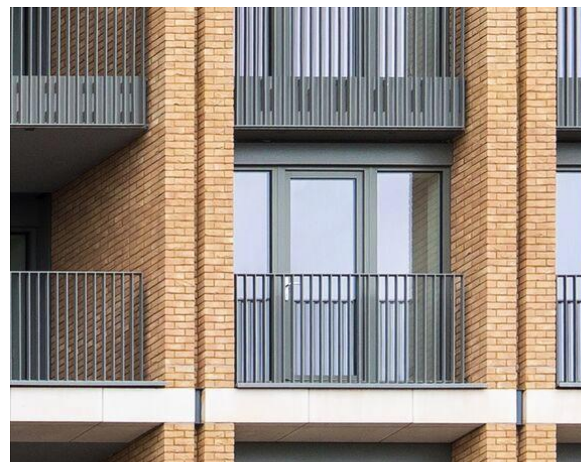
4/obster Architectural Cast Stone - Hendon Waterside Project