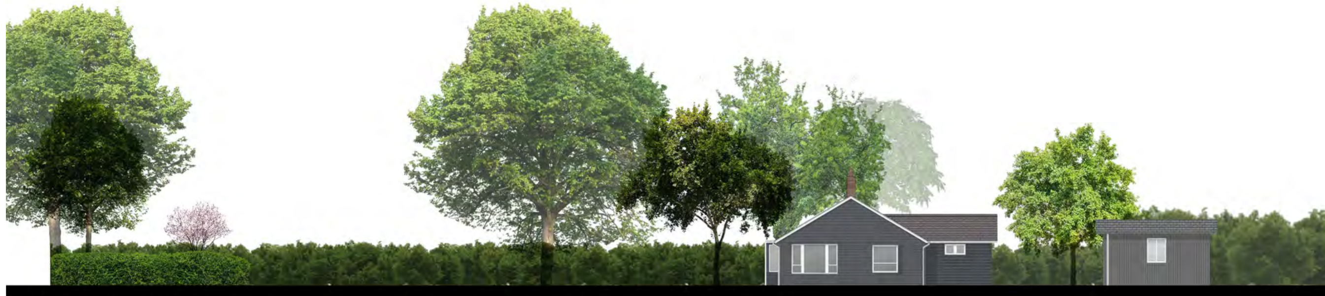
EXISTING SOUTH EAST ELEVATION | 1:200