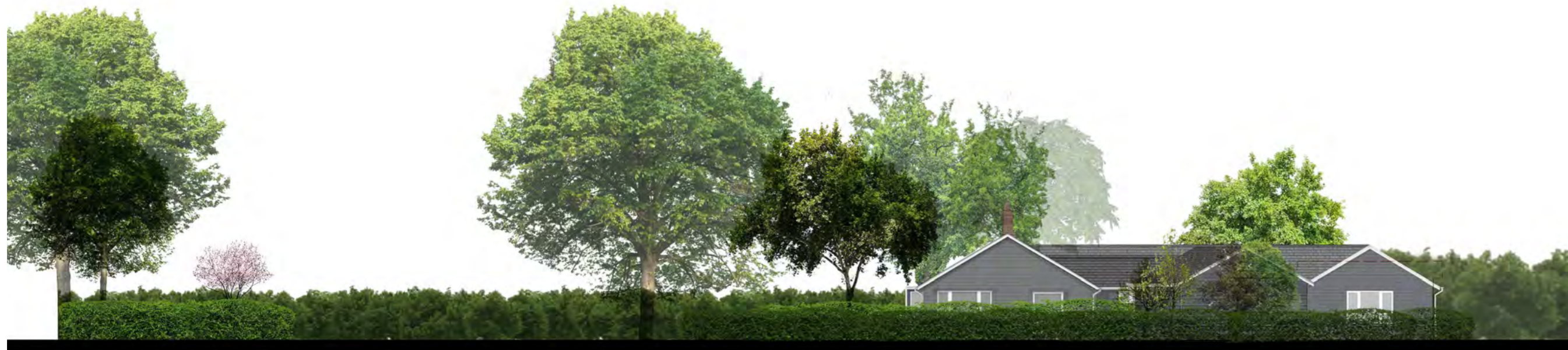
PROPOSED SOUTH EAST ELEVATION | 1:200