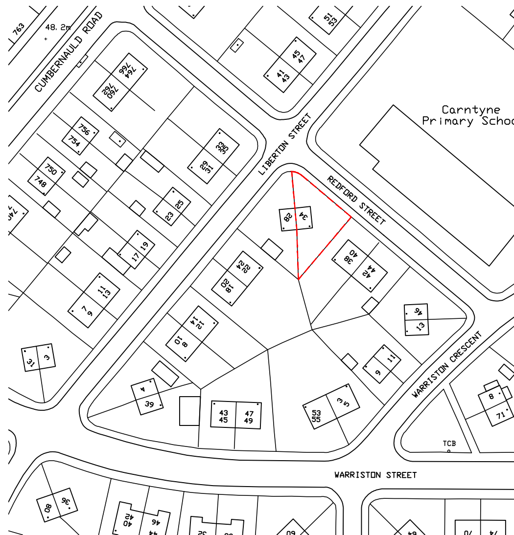
Existing Location Plan 1:1250 @ A3