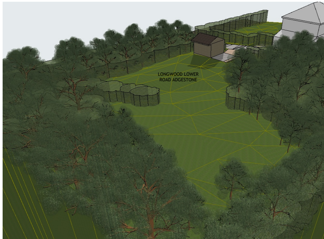
EXISTING REAR LEFT VIEW