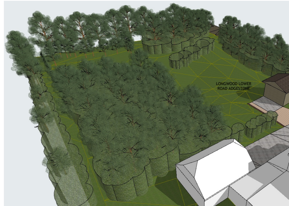
EXISTING REAR RIGHT VIEW