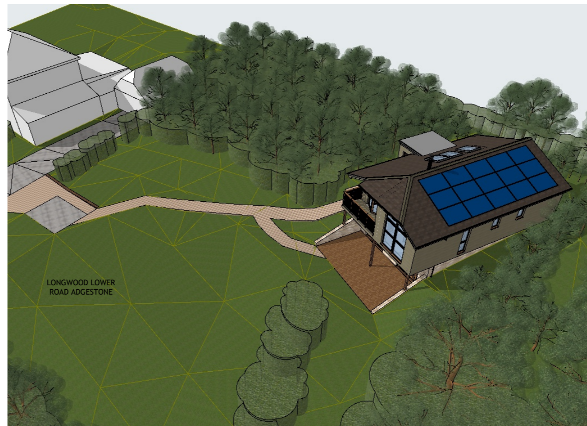
PROPOSED FRONT RIGHT VIEW