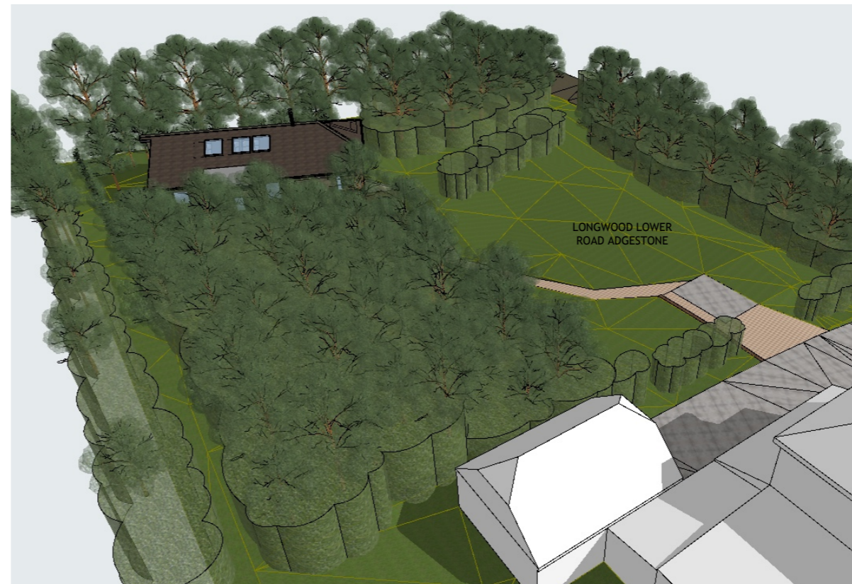
PROPOSED REAR RIGHT VIEW