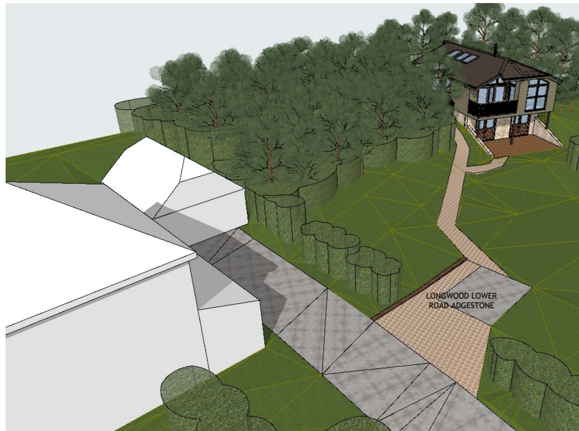
PROPOSED FRONT LEFT VIEW