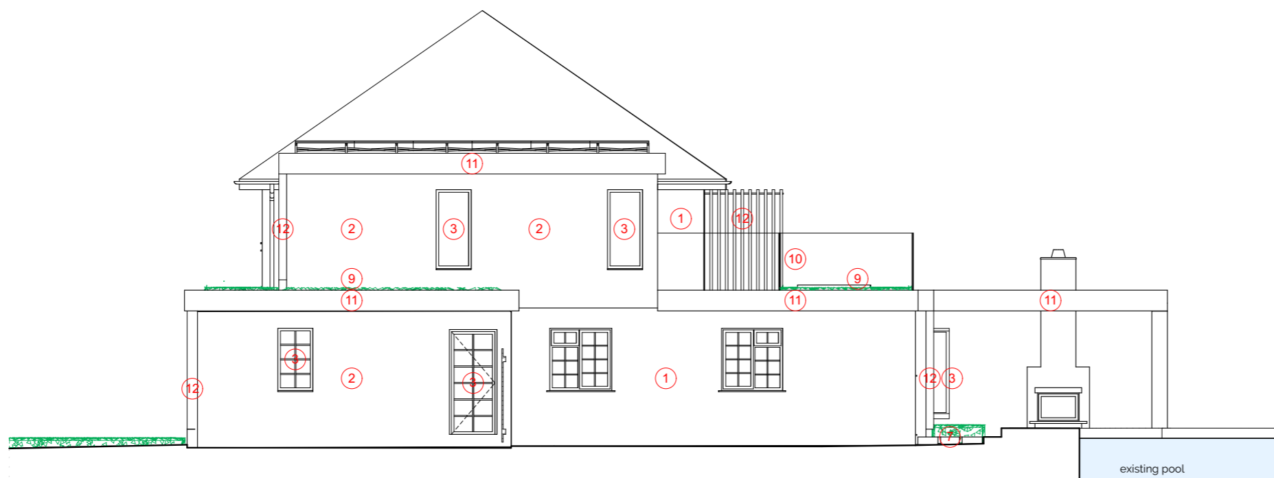
Proposed West Elevation 1:100