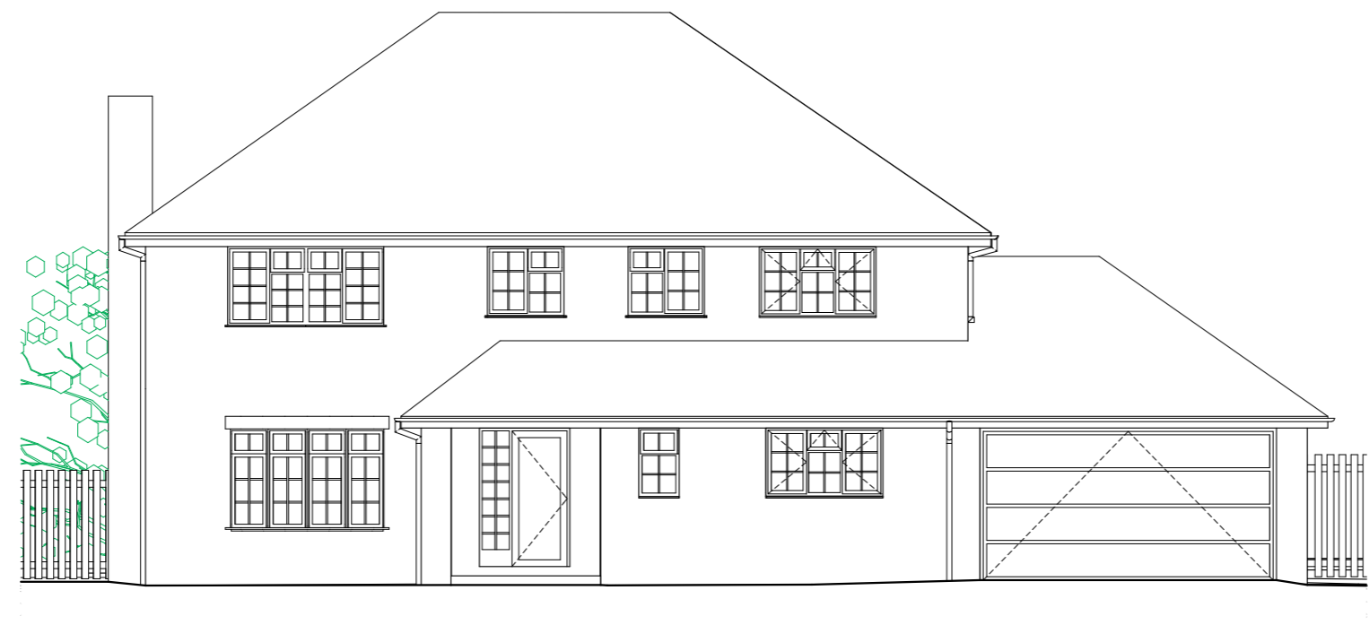
Existing North Elevation 1:100