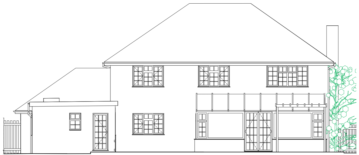
Existing South Elevation 1:100