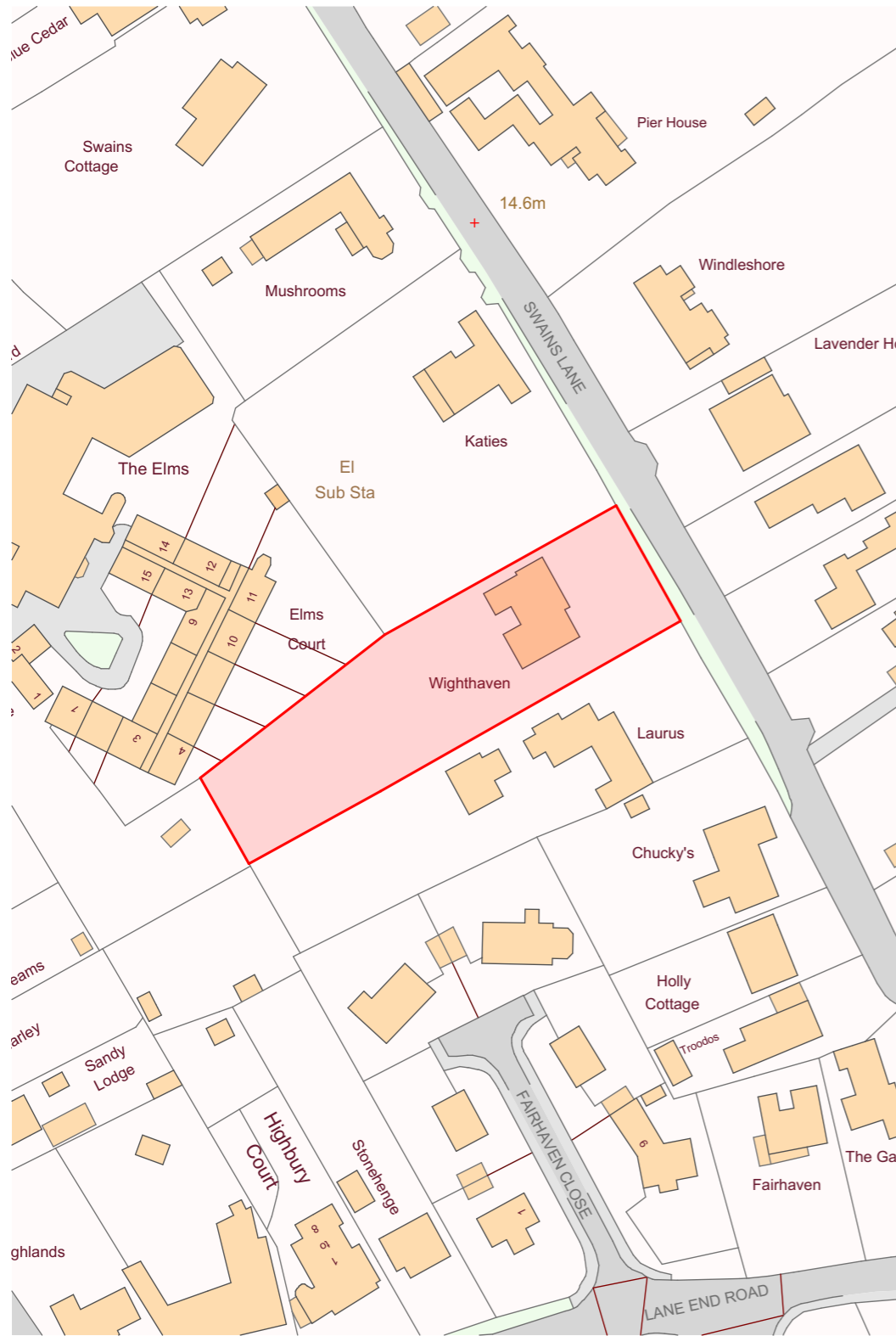
Existing Location Plan 1:1250