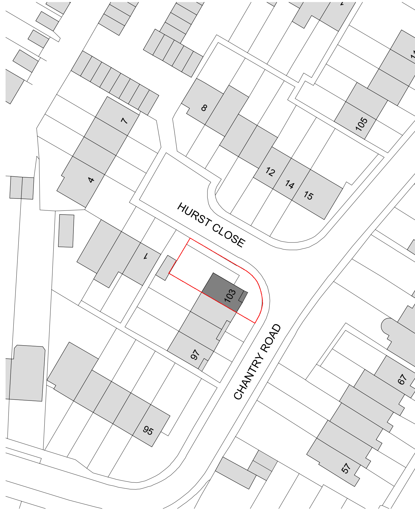
Existing Site Block Plan 1:500 @ A3