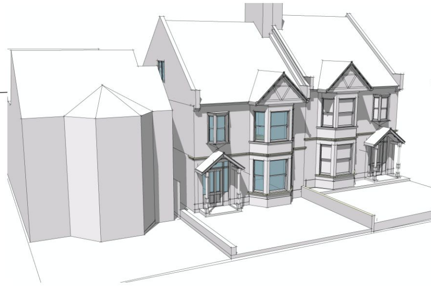
View of front

T: +44 (0)20 7183 3787 E: admin@husbandarchitects.co.uk W: www.husbandarchitects.co.uk