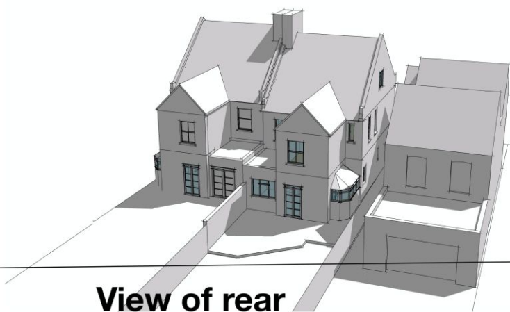
View of rear