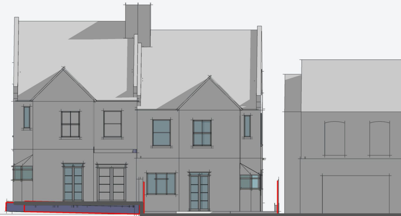
Rear Elevation 1:100 @A3