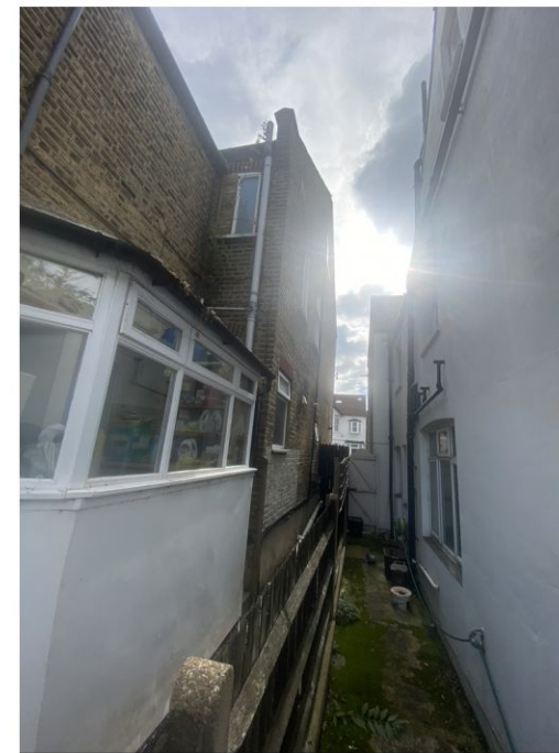
Photo showing side passageway