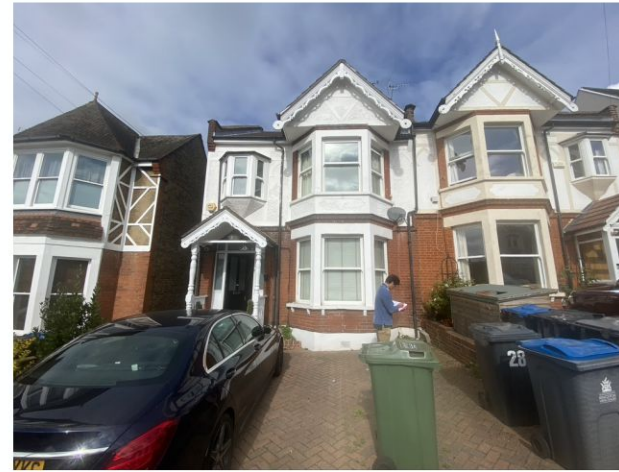
Photo showing front elevation from Dukes Av.