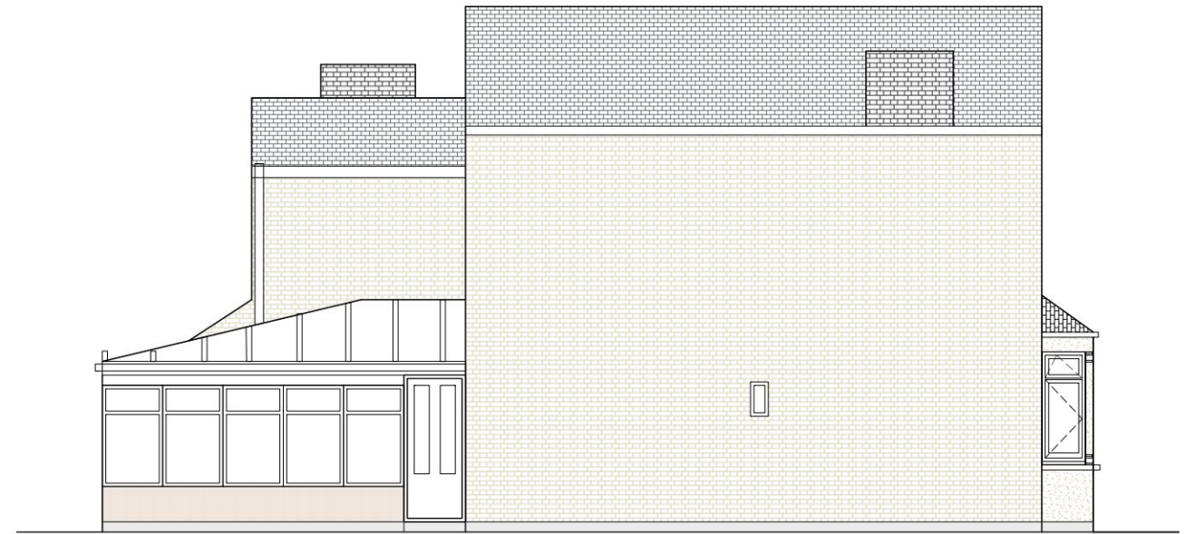
LEFT FLANK ELEVATION