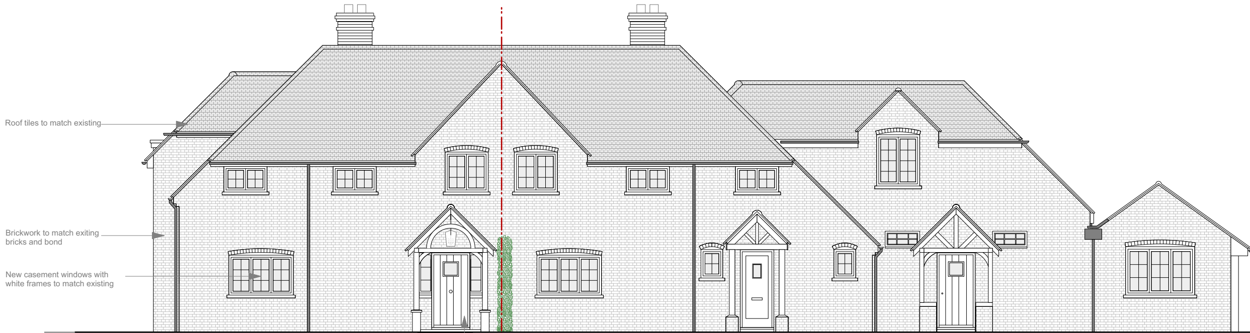
1 Front Elevation Proposed Scale: 1:100

New timber front door and timber framed porch with tiled roof to match existing