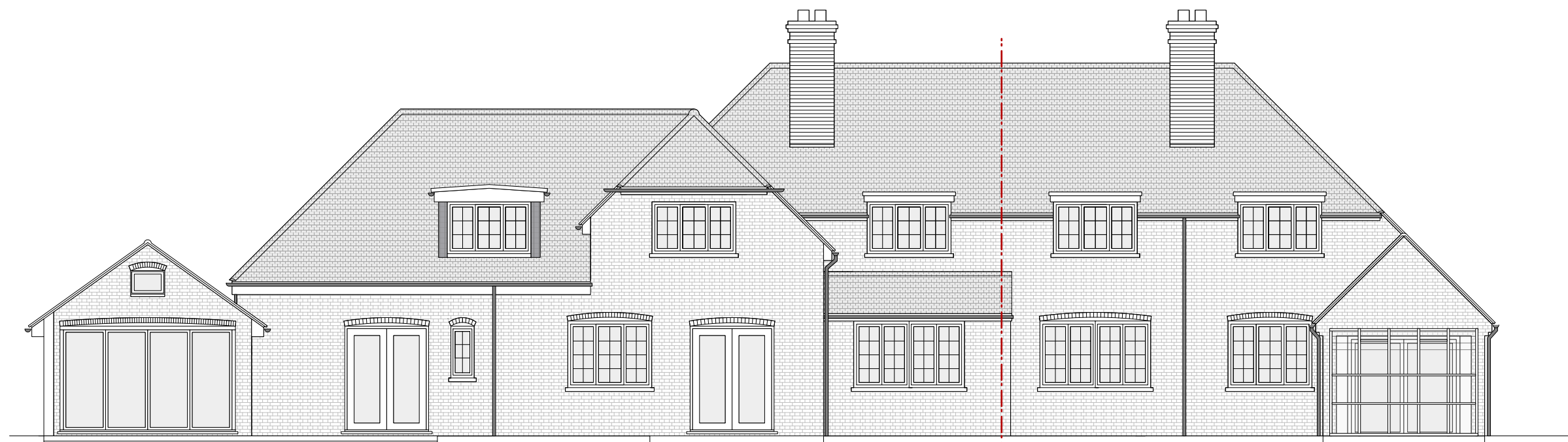
1 Rear Elevation Existing Scale: 1:100