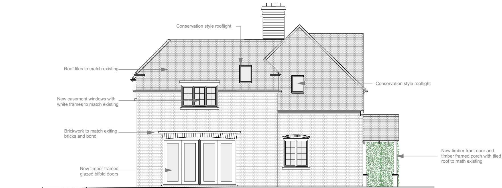
1 Side Elevation Proposed Scale: 1:100