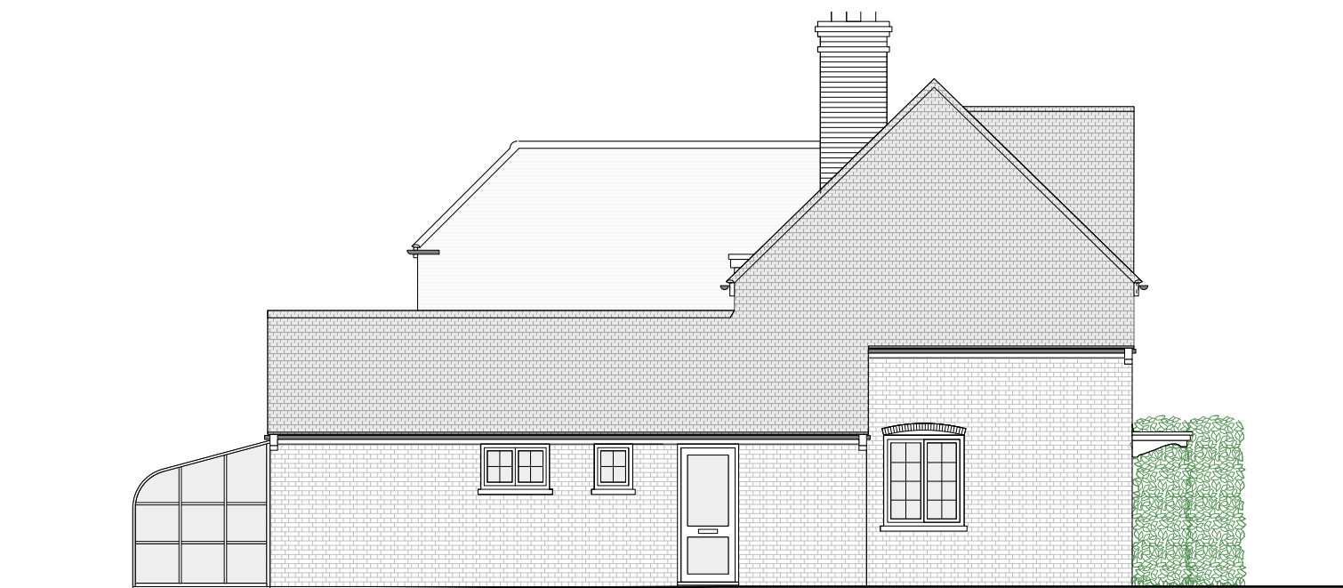
1 Side Elevation Existing Scale: 1:100