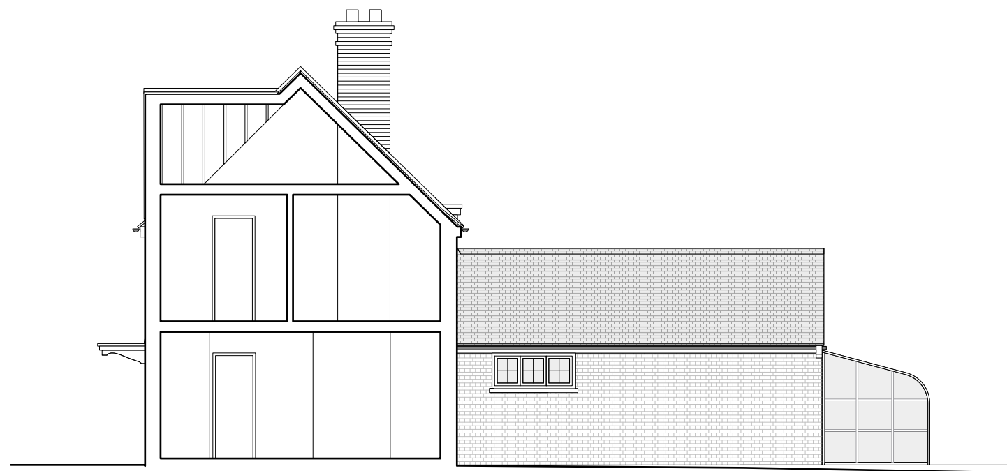
1 Section A_A Existing Scale: 1:100