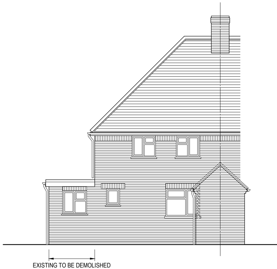
WEST (REAR) ELEVATION