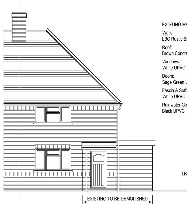
EAST (FRONT) ELEVATION