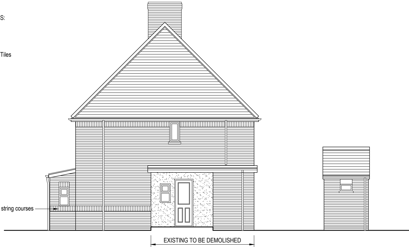
SOUTH (SIDE) ELEVATION