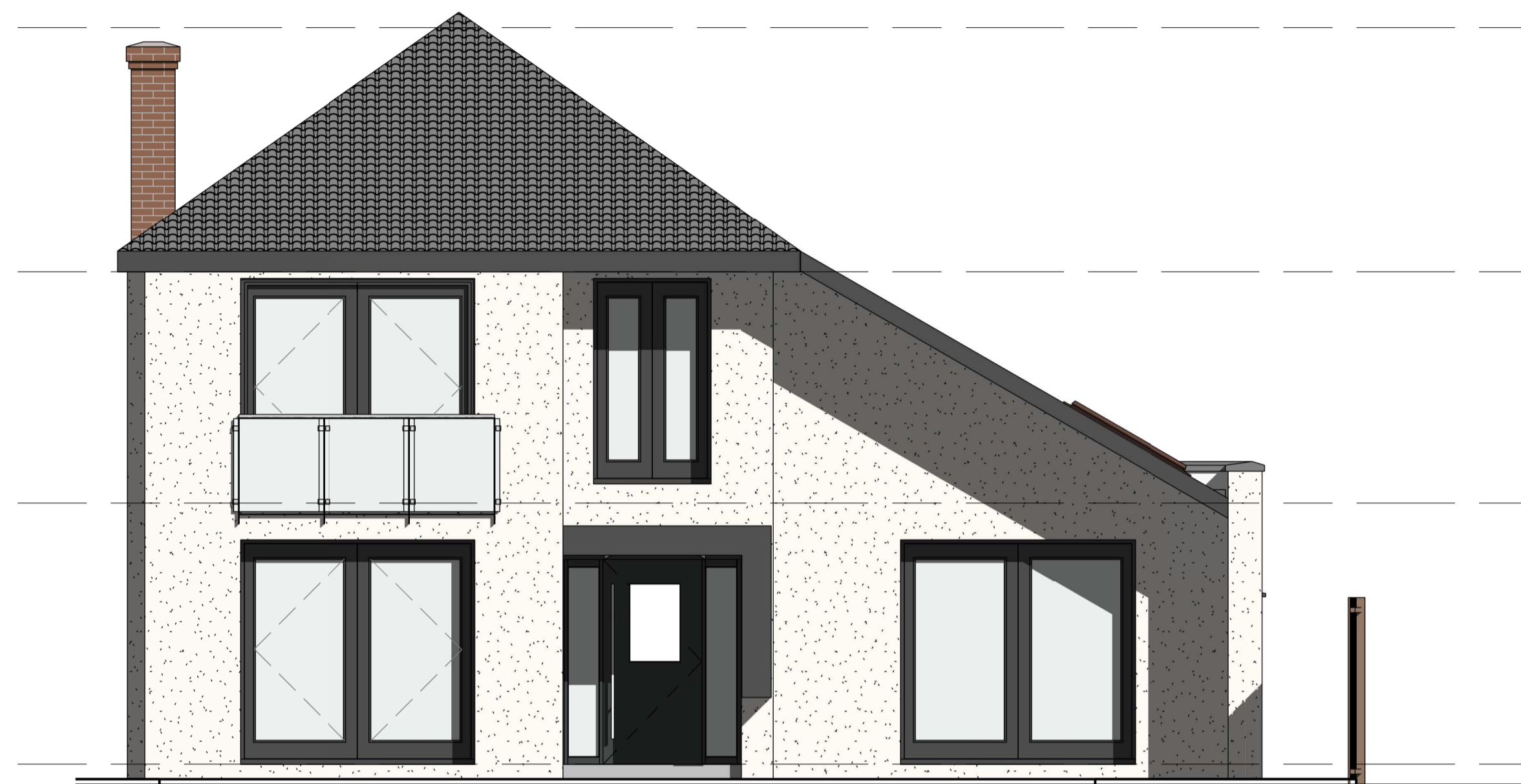
1 Front Elevation 1 : 50