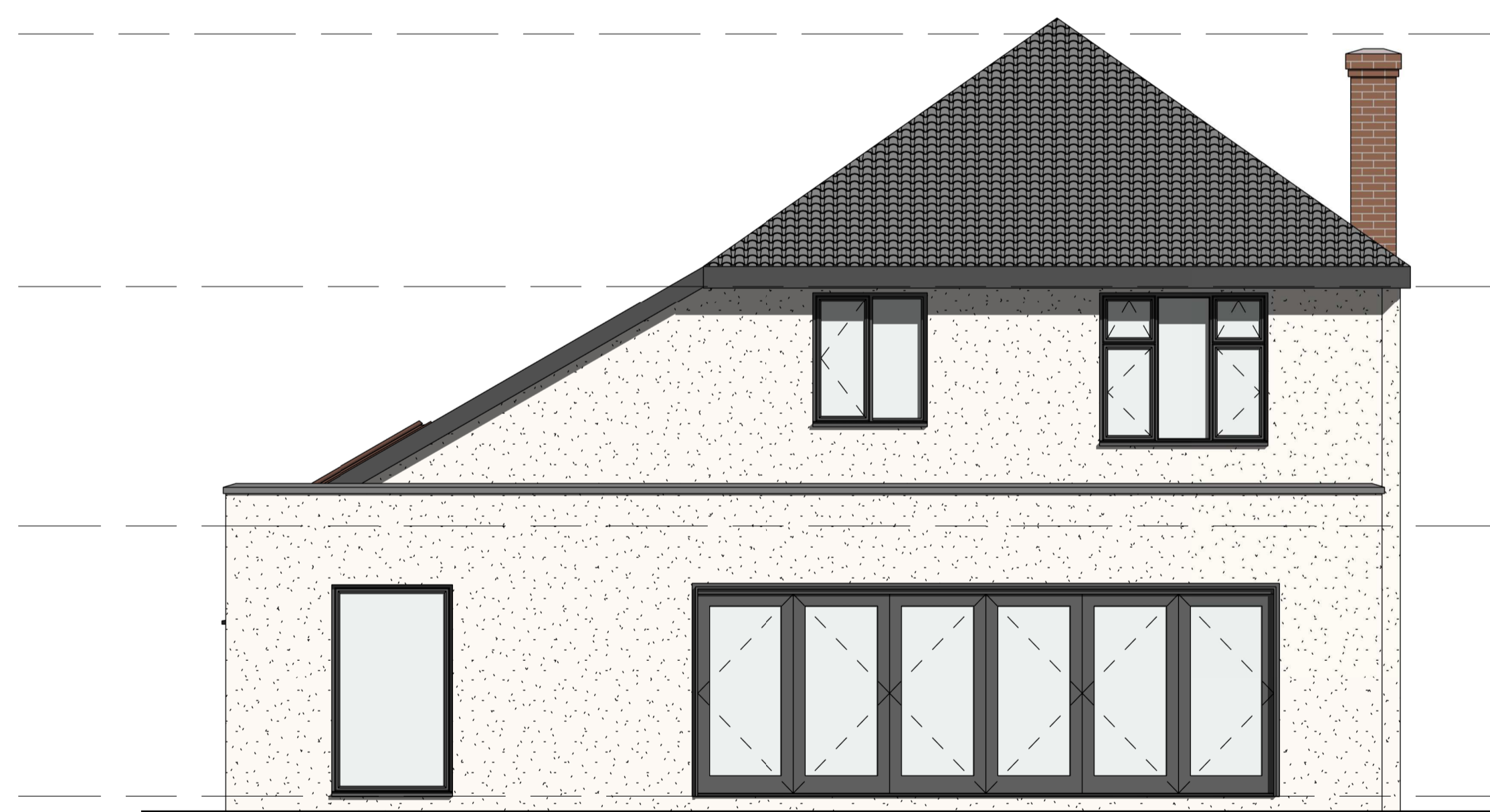
3 Rear Elevation 1 : 50