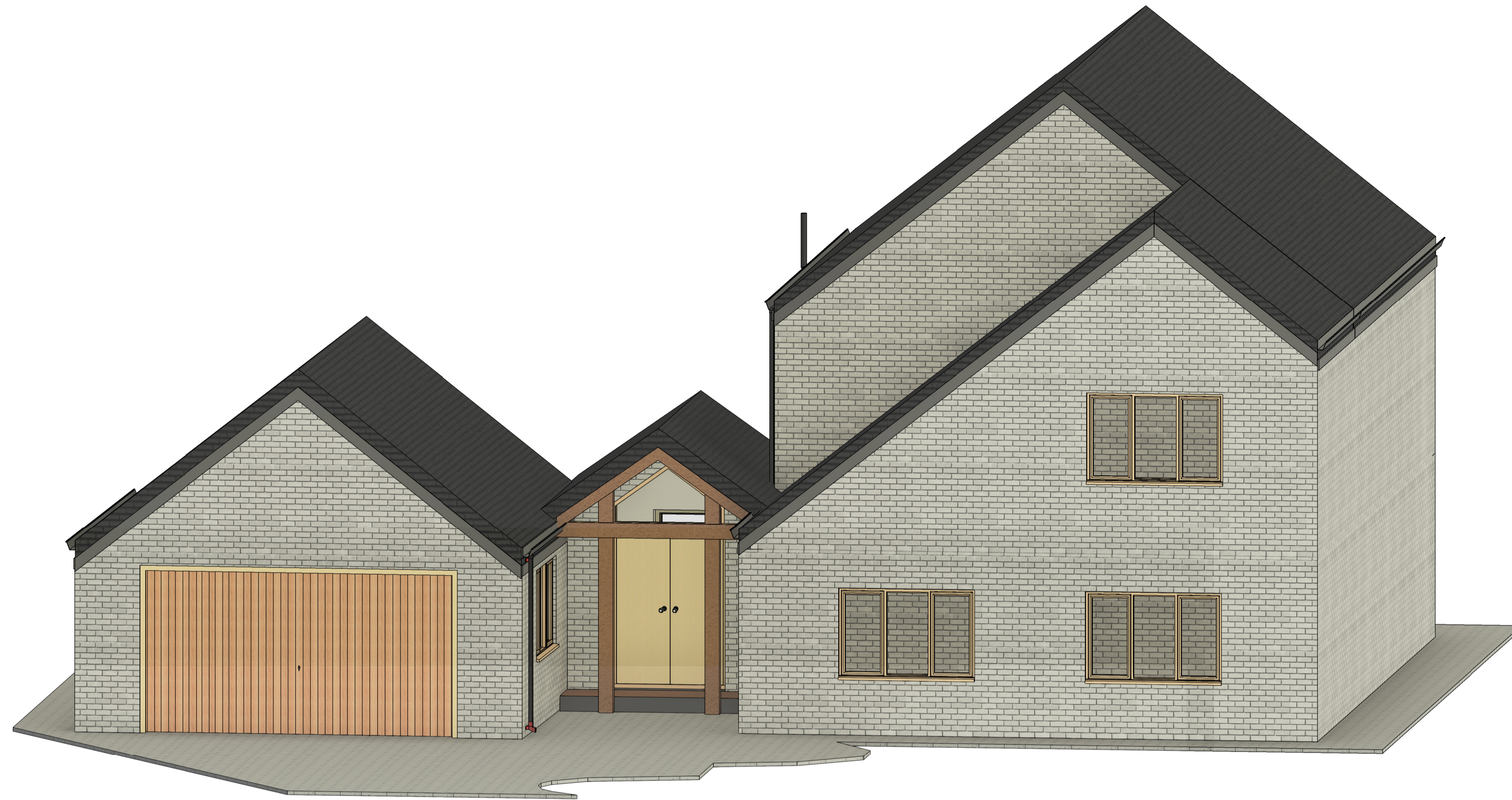
Proposed extension perspective A