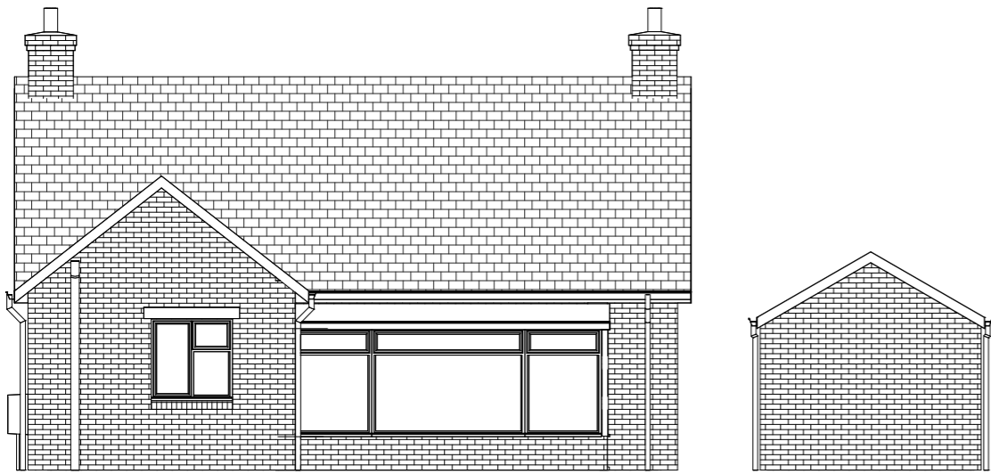
3 Rear Elevation 1 : 100