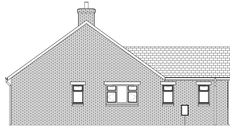
4 Side Elevation 1 : 100