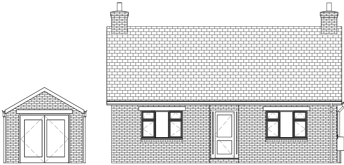
1 Front Elevation 1 : 100