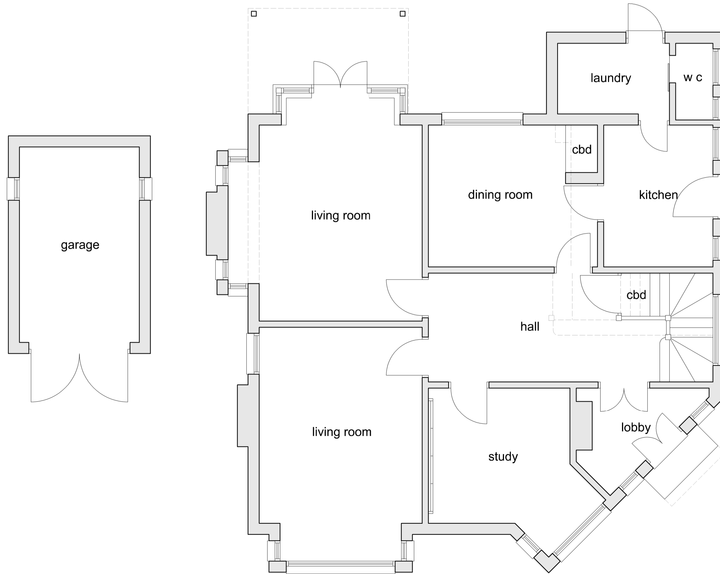
Existing ground floor layout