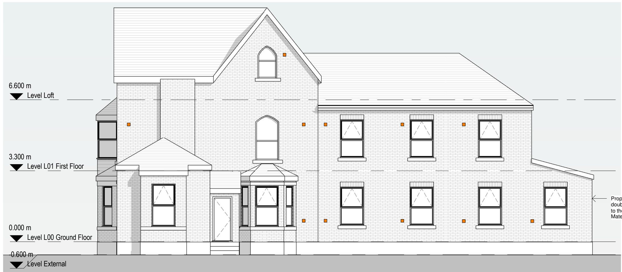
1 Proposed North Elevation 1 : 100