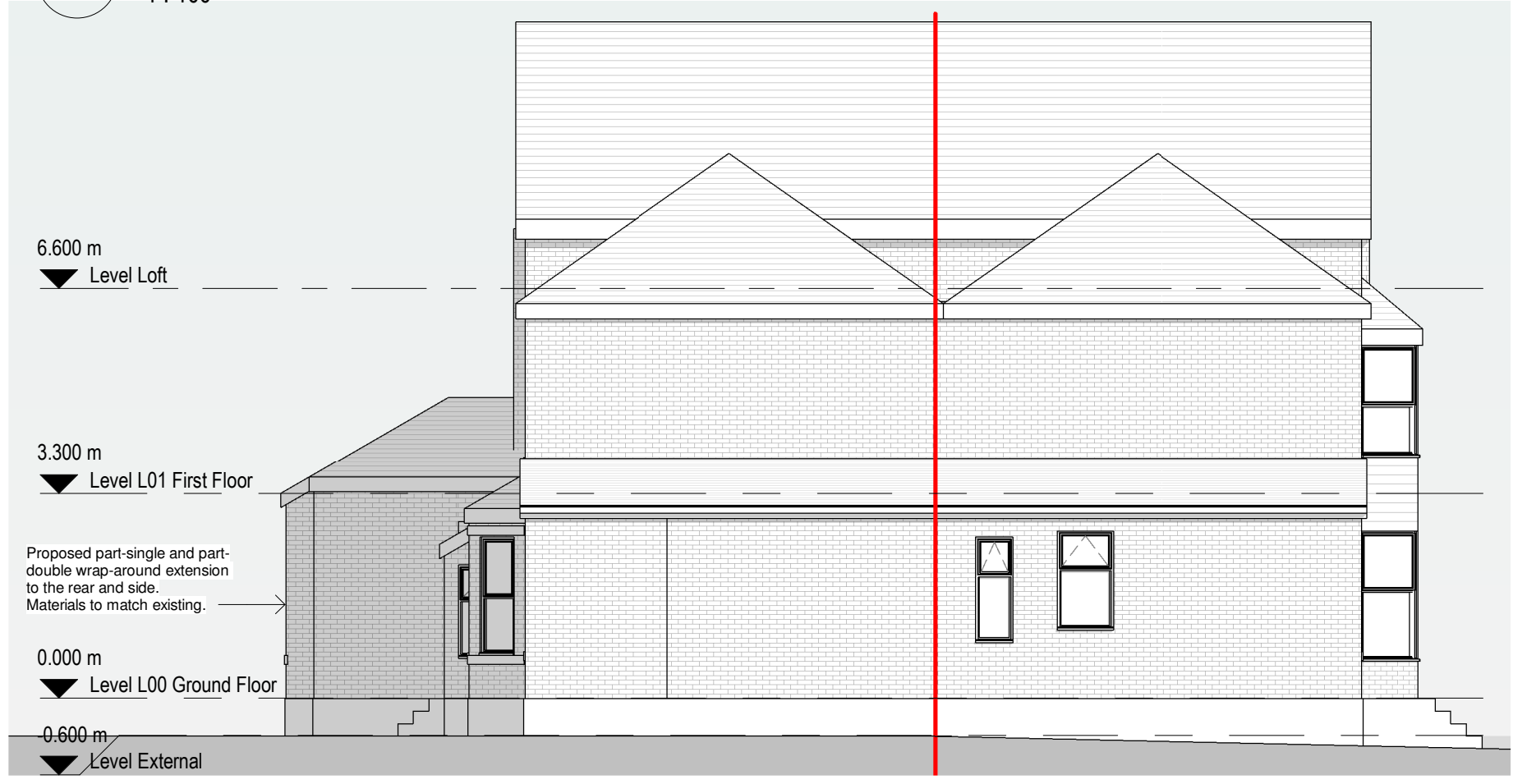
2 Proposed West Elevation 1 : 100