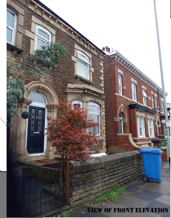
VIEW OF FRONT ELEVATION

D@C DESIGN ARCHITECTURE & PLANNING 0776 452 3545 0161 425 3934