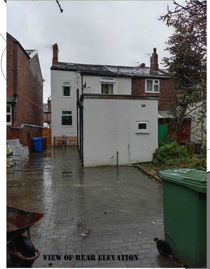
VIEW OF REAR ELEVATION