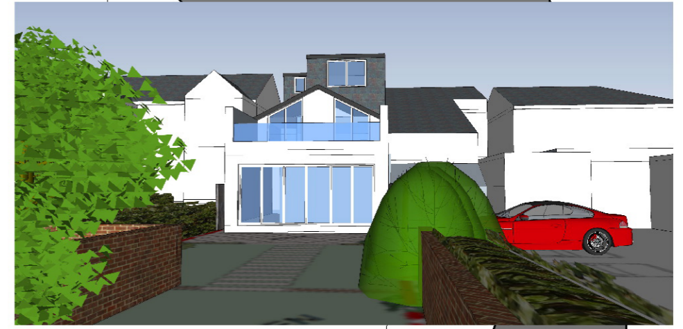
VIEW FROM GARDEN