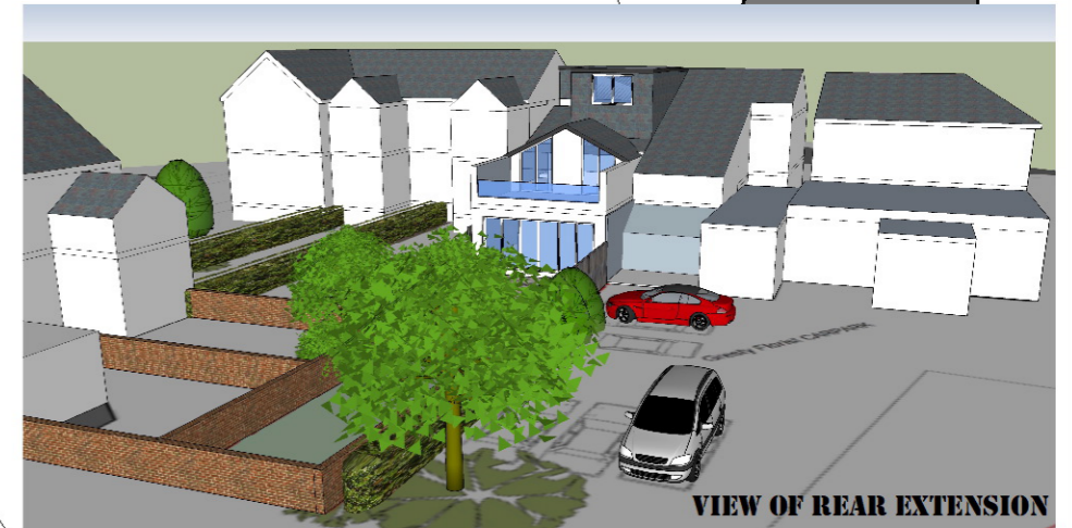
VIEW OF REAR EXTENSION