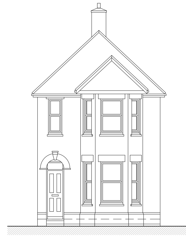
Front (Northern) Elevation