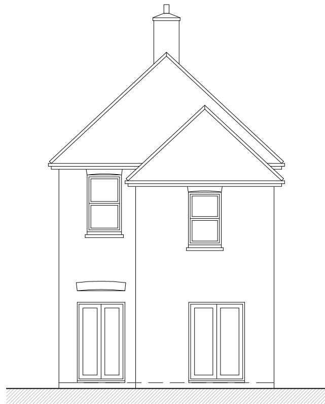
Rear (Southern) Elevation