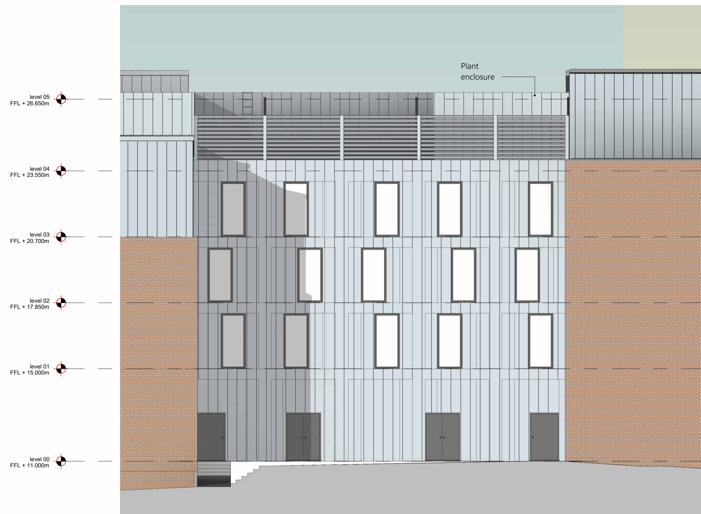
South East Elevation Scale: 1:100