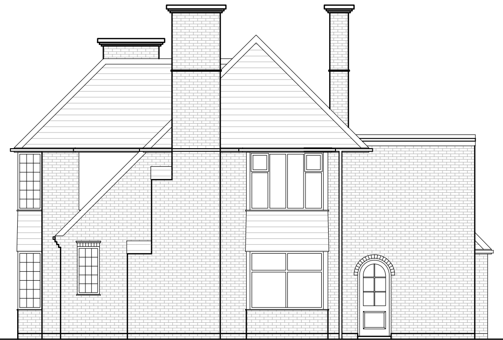
02 EXISTING SIDE ELEVATION Scale 1:100