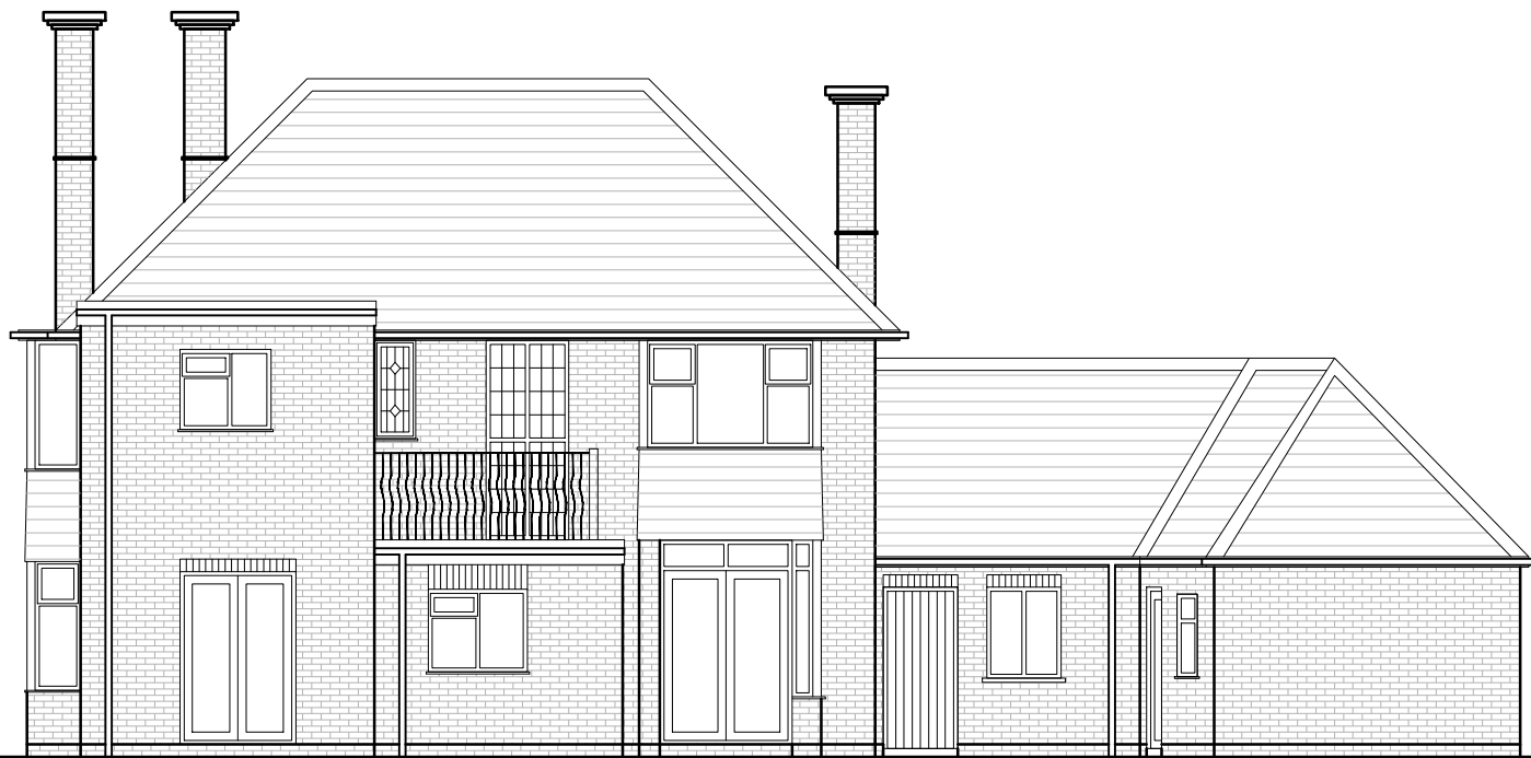
03 EXISTING REAR ELEVATION Scale 1:100