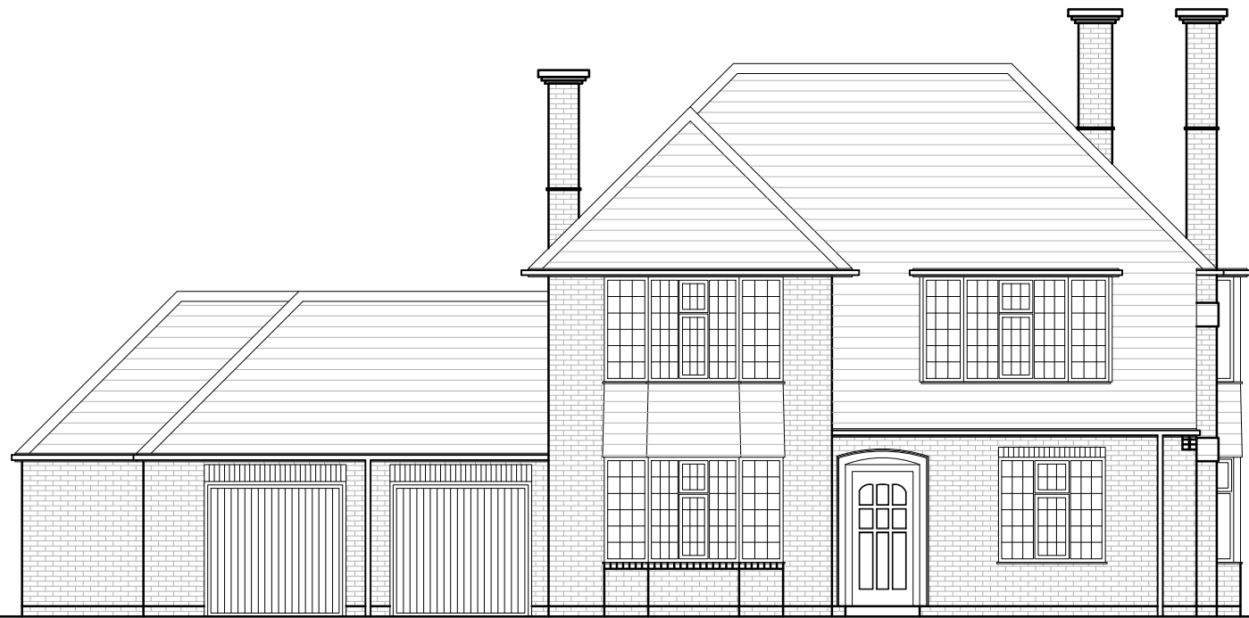
01 EXISTING FRONT ELEVATION Scale 1:100