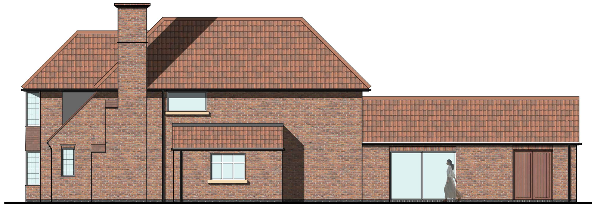
02 PROPOSED SIDE ELEVATION Scale 1:100