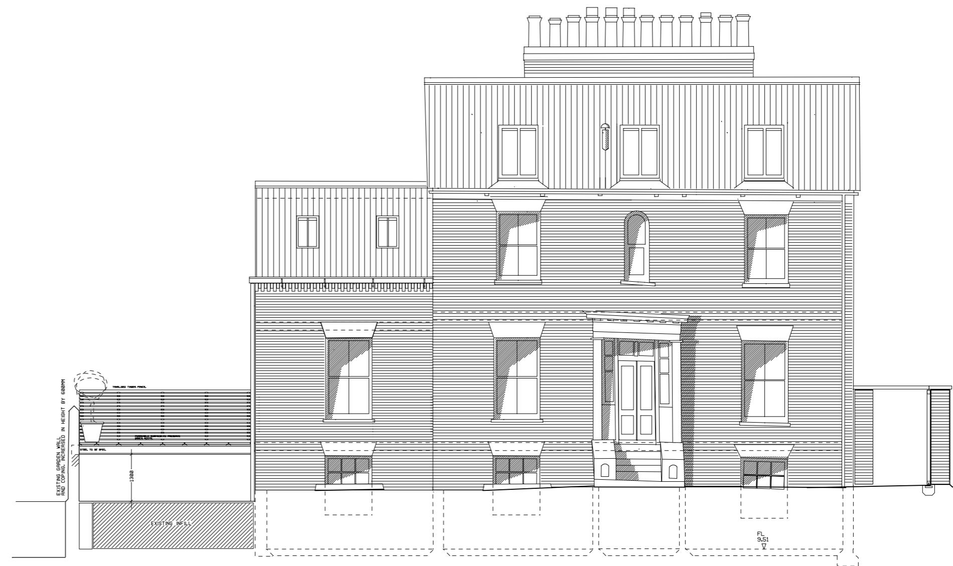
PART SECTION - PROPOSED, SOUTH.

The copyright of this drawing remains the property of Mitchell Design Consultancy Ltd and must not be copied or reproduced without written permission of Mitchell Design Consultancy Ltd.