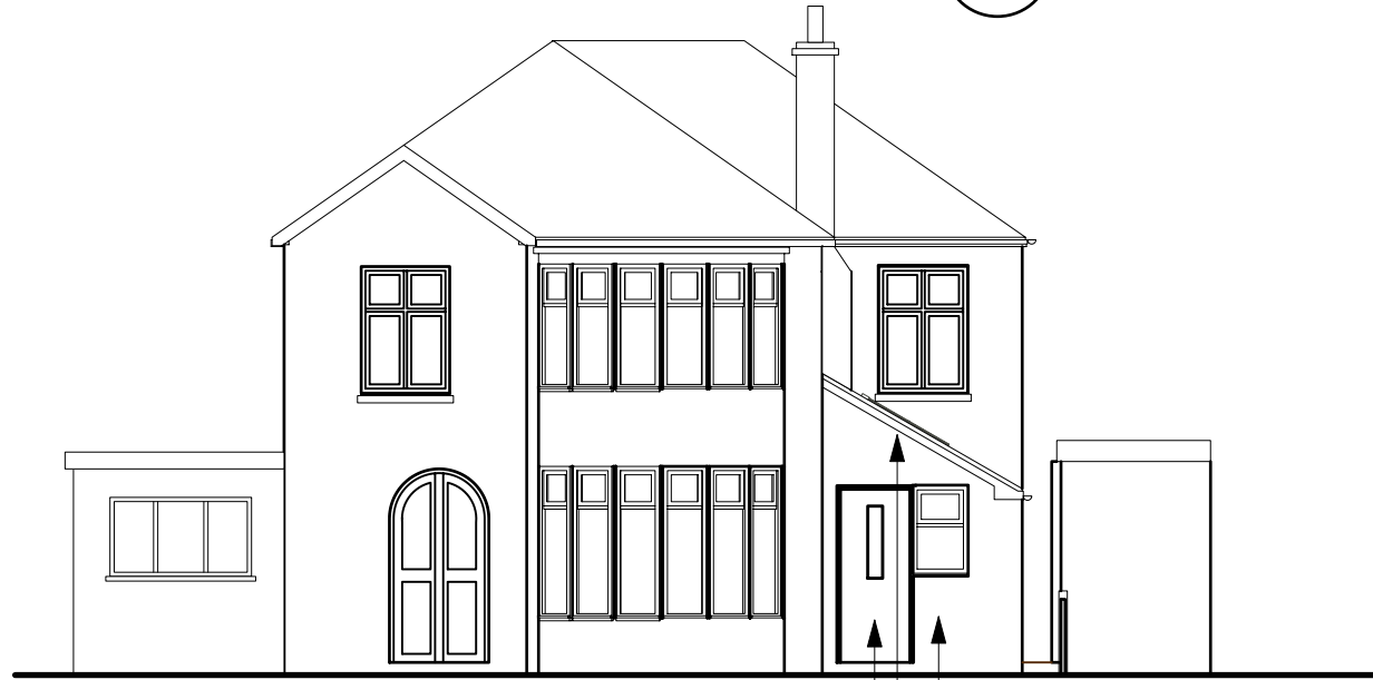
○ Front elevation Scale: 1:100

Facing brickwork to match existing Bargeboard to match existing Existing external door and window moved to new openings