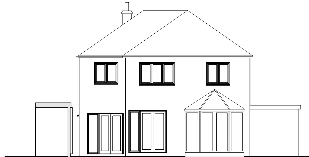
○ Rear elevation Scale: 1:100

Clay plain tile roof to match existing Fascia and gutter to match existing Facing brickwork to match existing