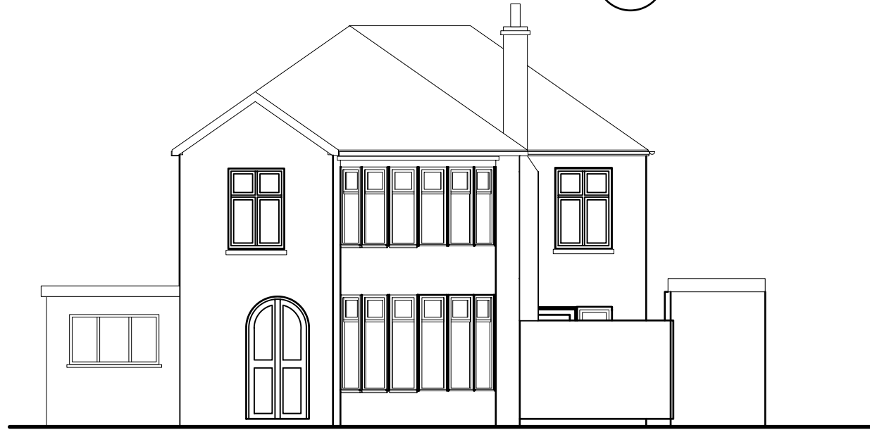
○ Front elevation Scale: 1:100